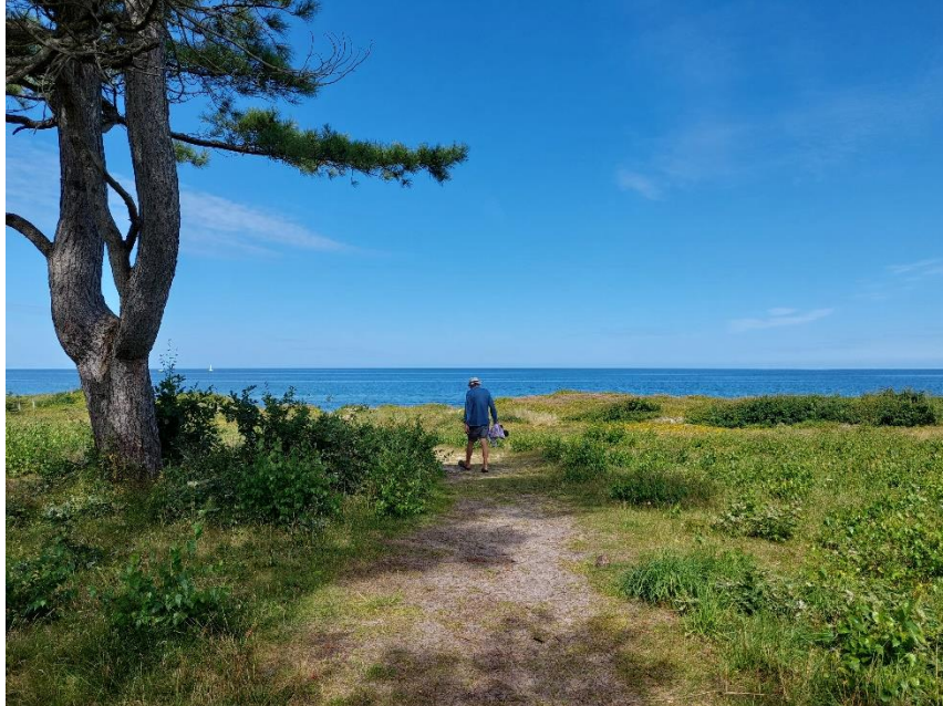
The beach there is, in good weather, like the Mediterranean