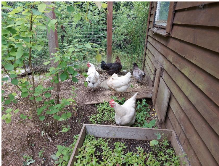
We got chickens again