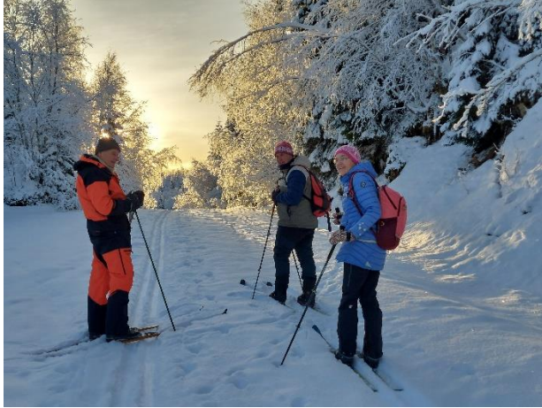
We even went skiing, first time in some years