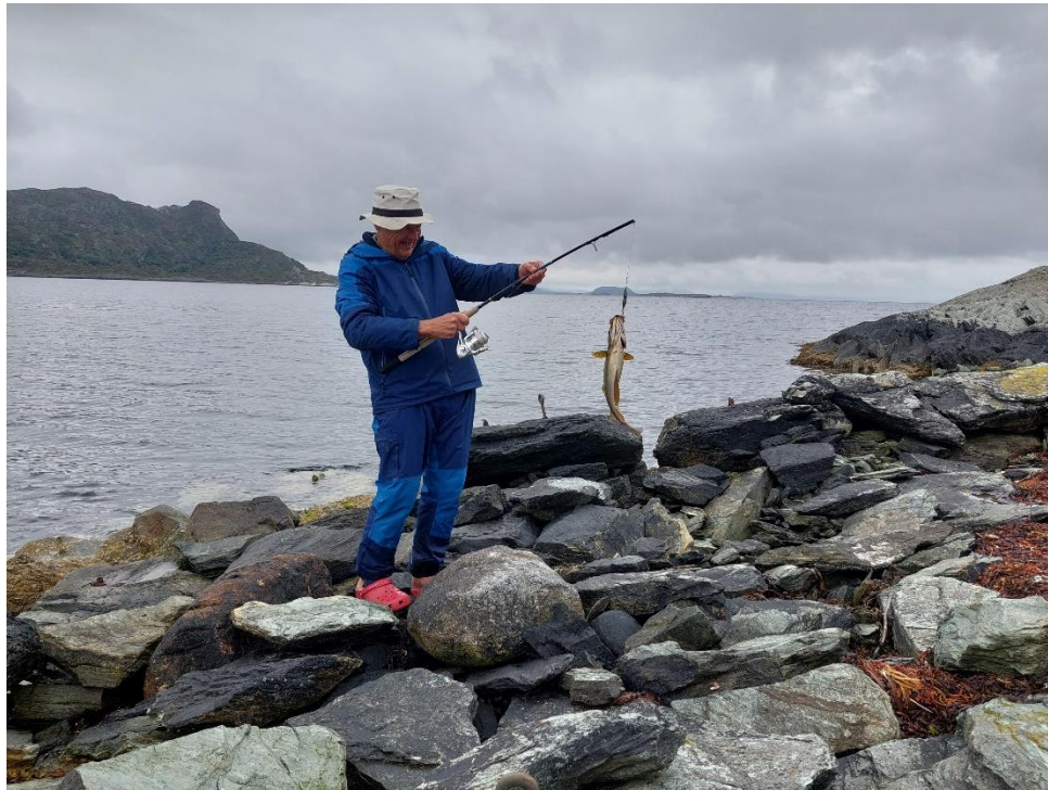
We got fish