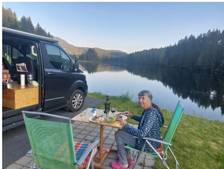
New camping trip to Sweden