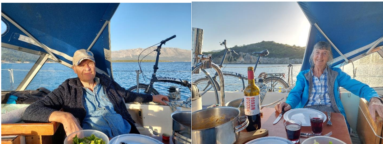
Taking it easy in our old age