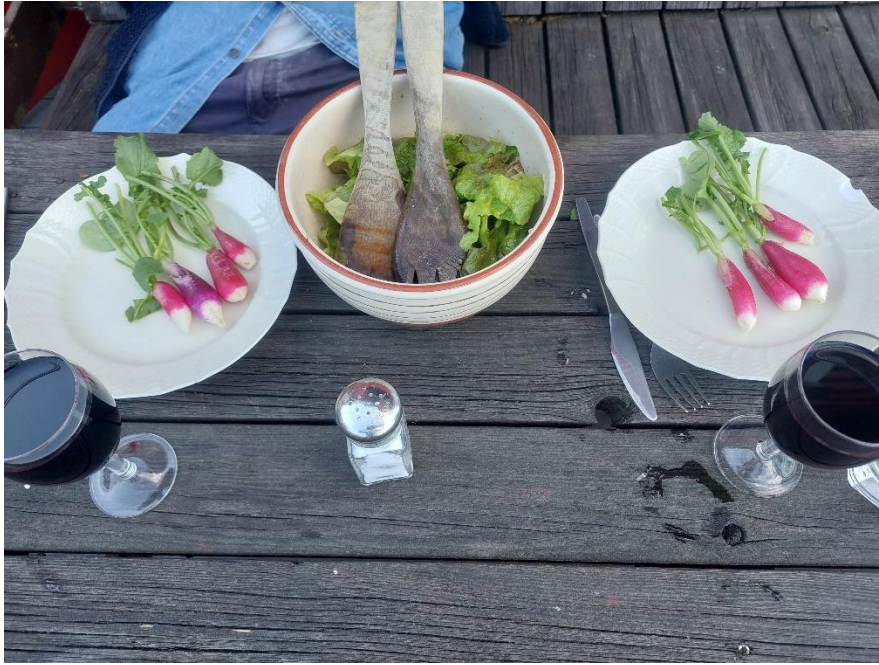
The first harvest from our greenhouse