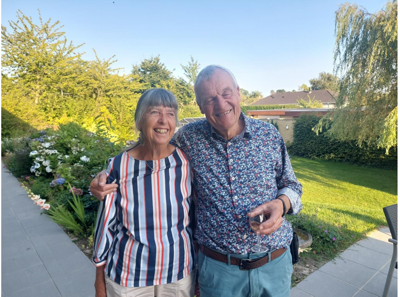
The old couple