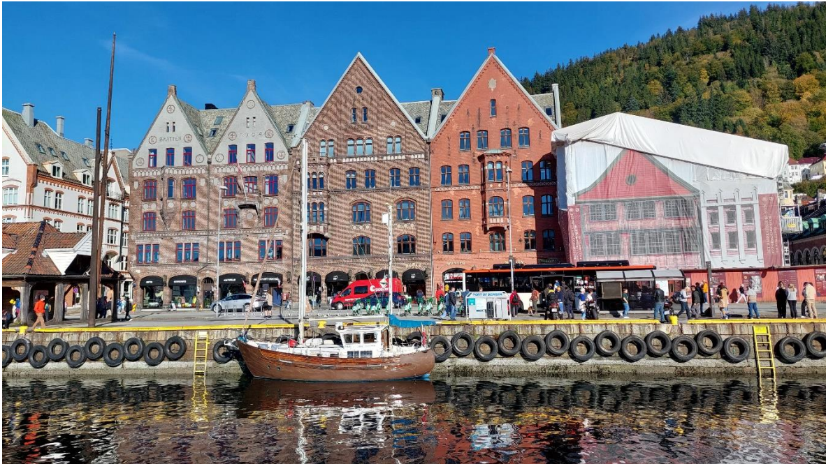
Maja at Bryggen