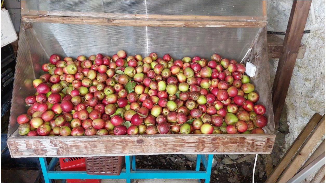
The apple harvest was good this year