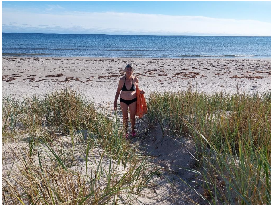
Gotland swimming, a bit cold