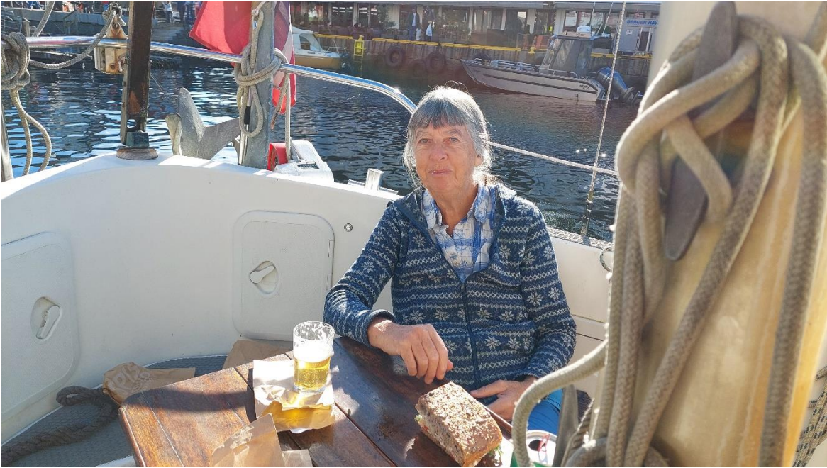
Good weather in Bergen