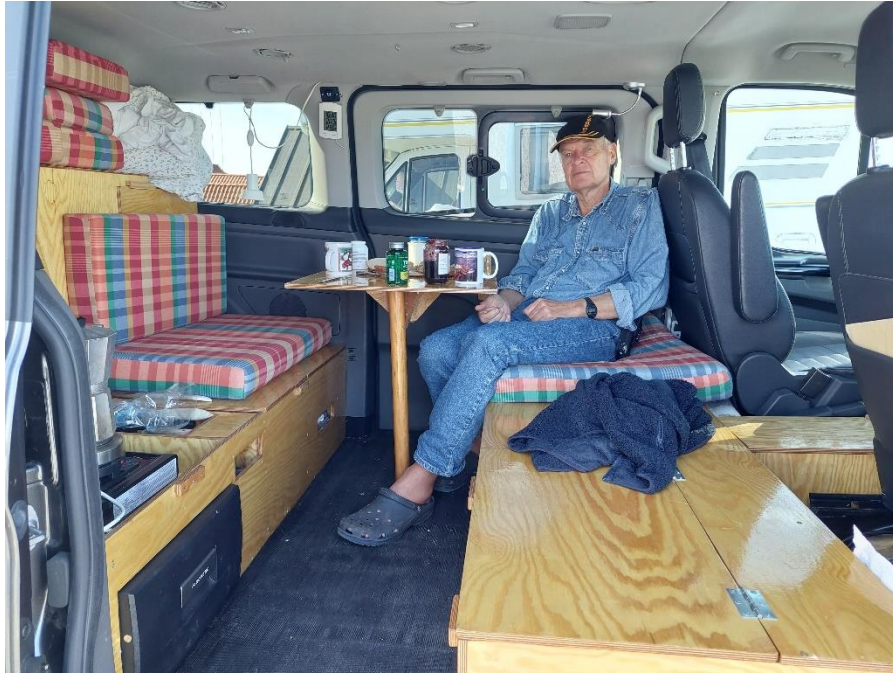
Start of camping trip to Brittany