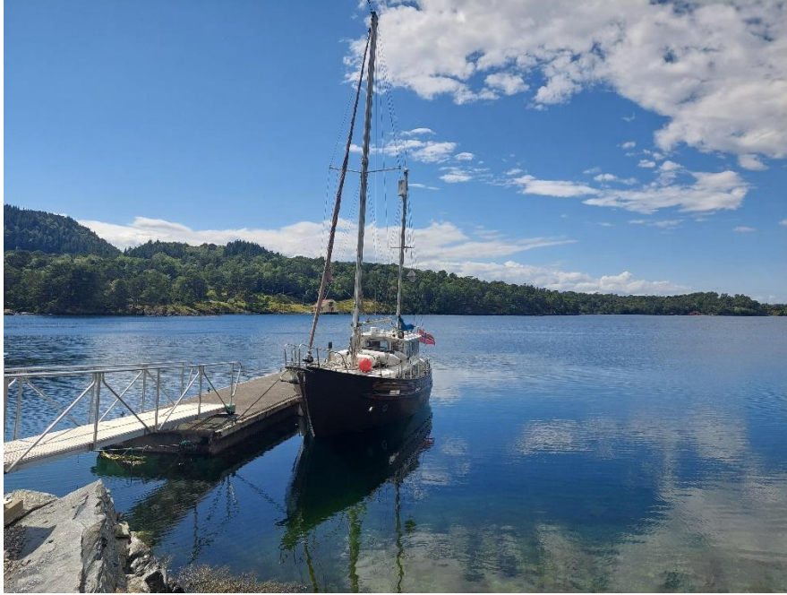
Summer boat trip