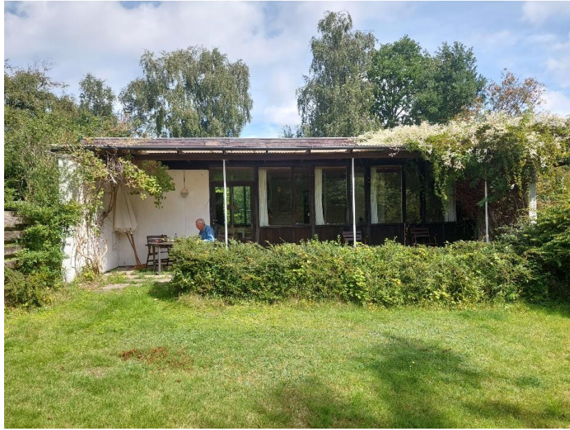
On the way back, we stopped in our summerhouse in Denmark