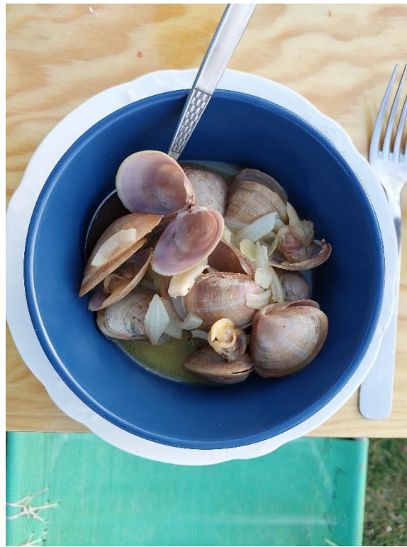
On the way we found dinner on the beach of Normandy