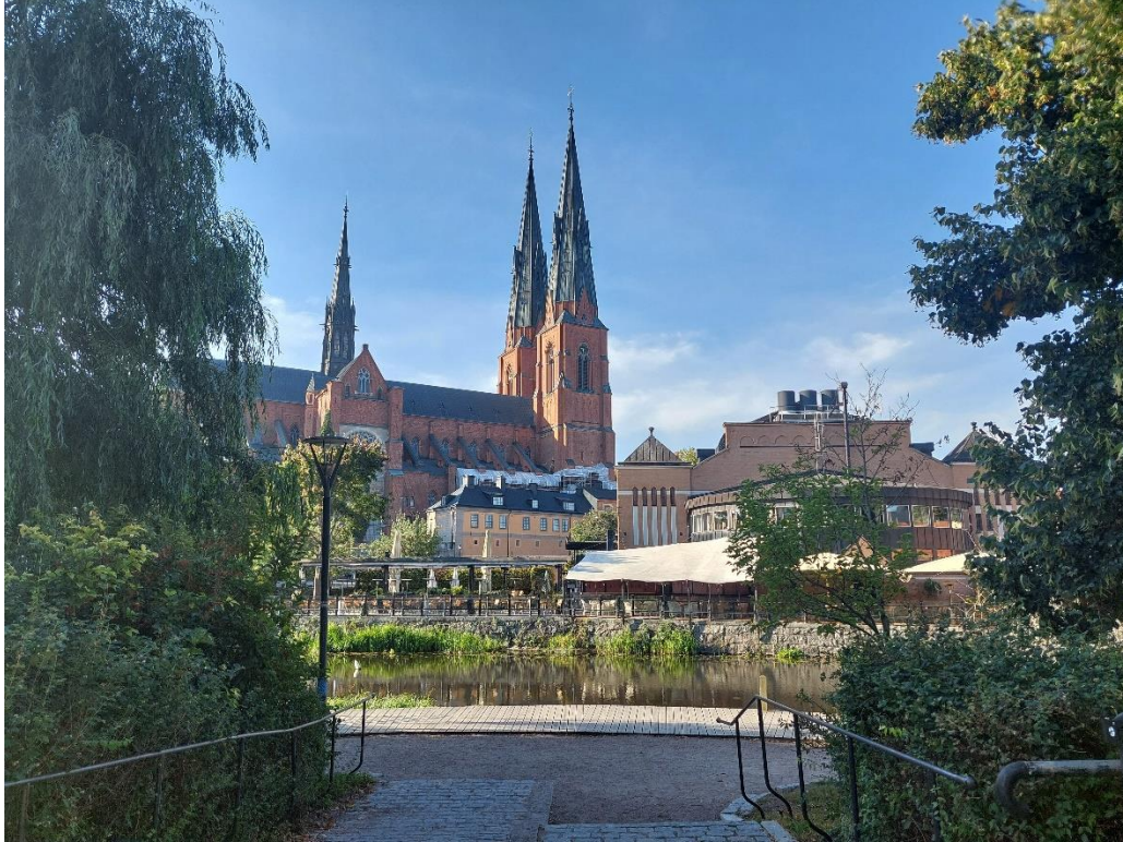
Uppsala was nice