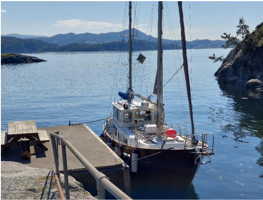
Day trip to nearby Island