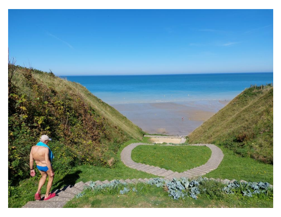
Normandy has nice beaches and campgrounds.