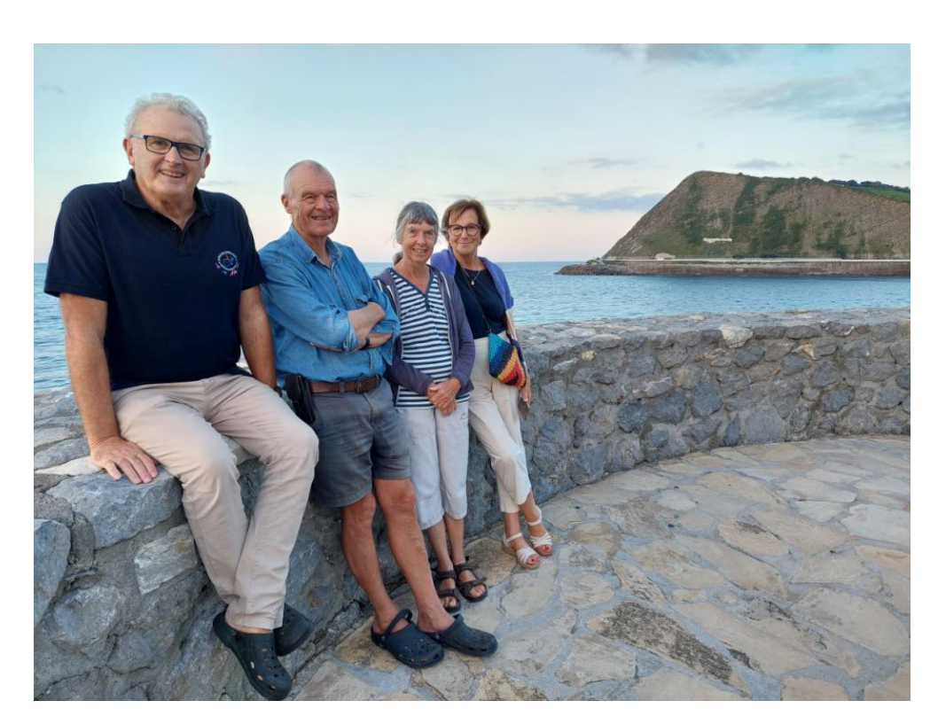
Visiting sailing friends in the Basque country.