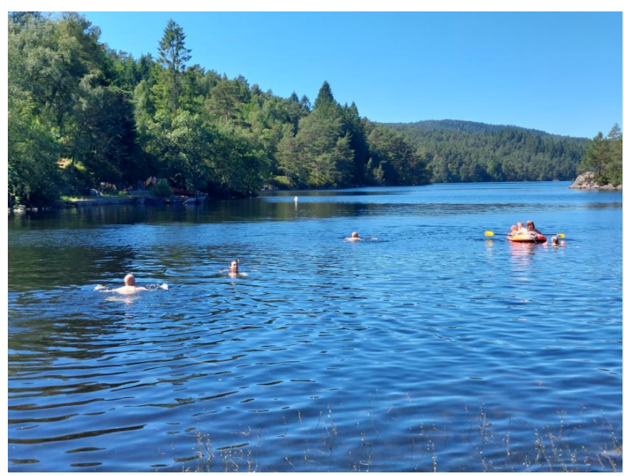
Family at our local lake.