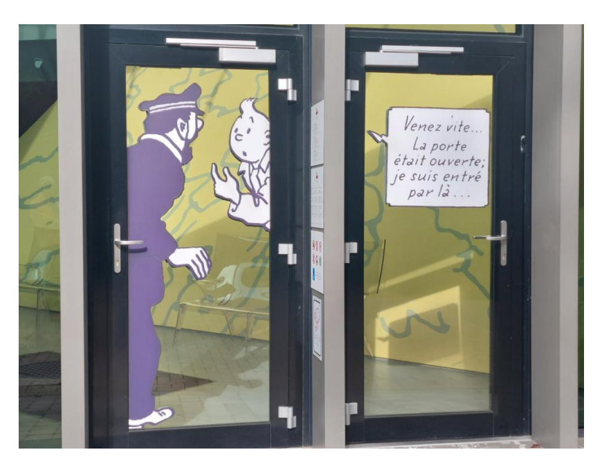
An important stop was to visit the Tintin museum in Belgium.