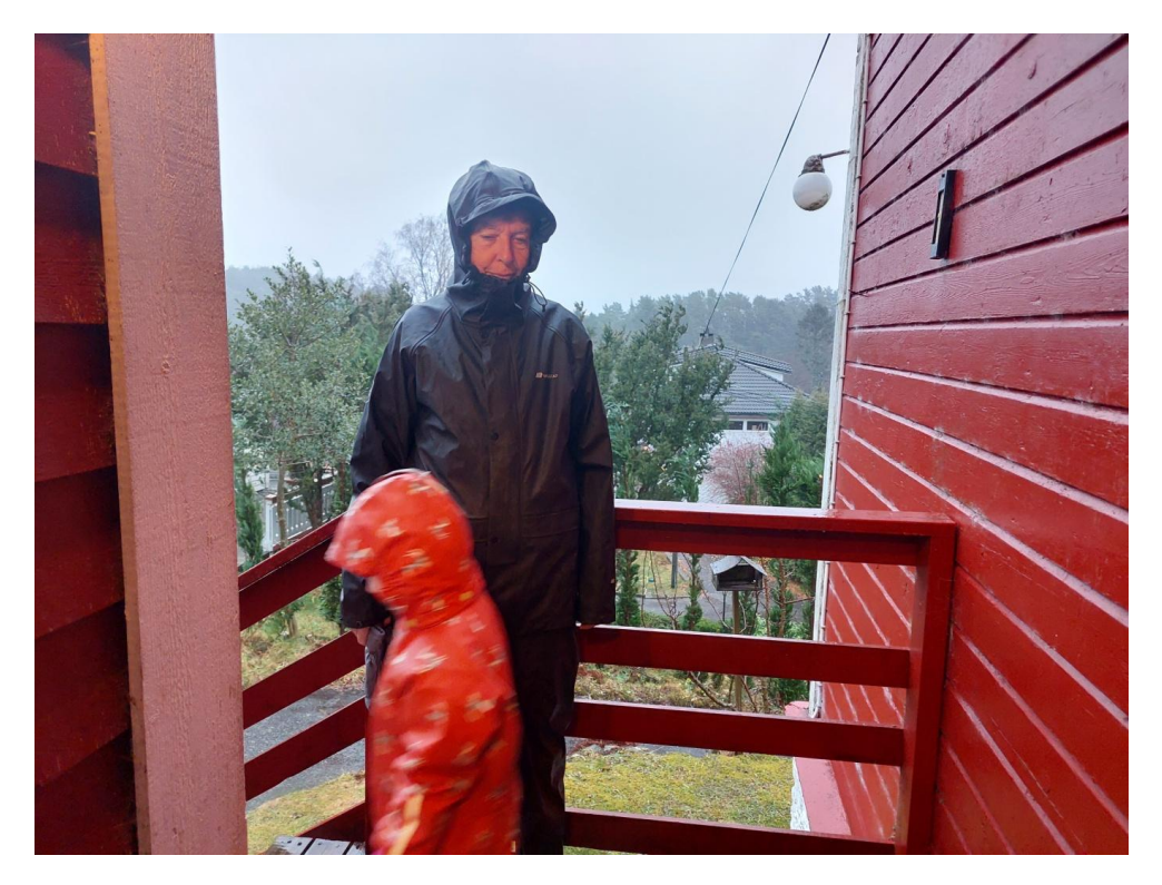
The rainy month.