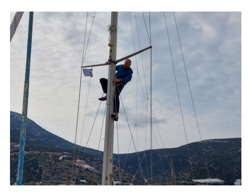
The old man still climbs the mast.