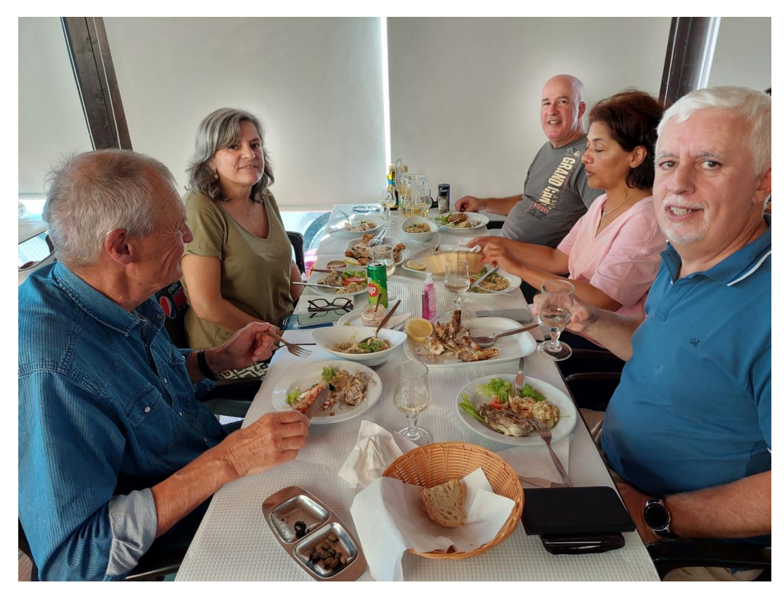
Fish dinner with friends from Lisboa.