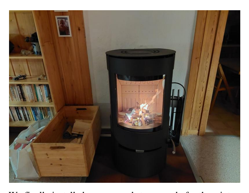
We finally installed a new wood stove, ready for the winter.