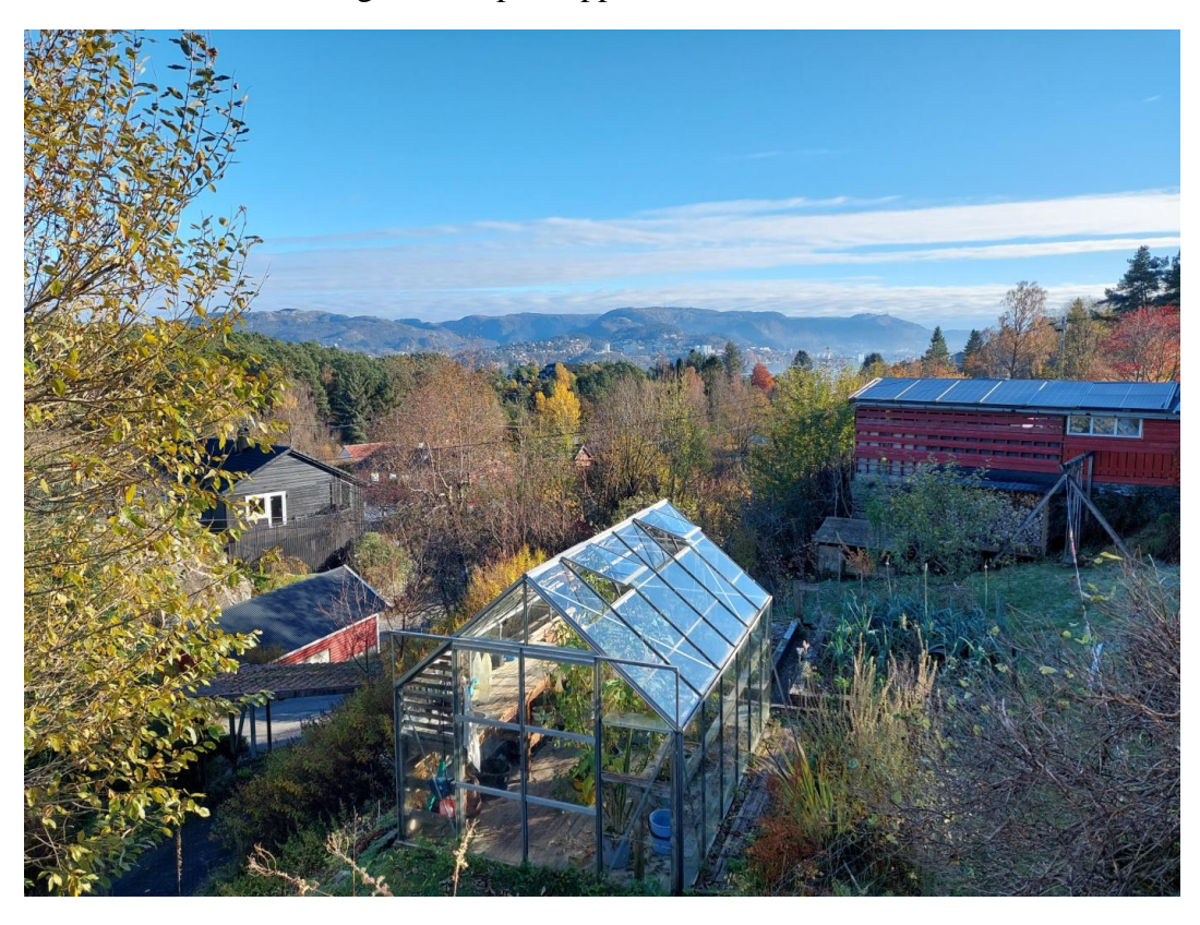
Home with a sky almost as blue as in Greece.