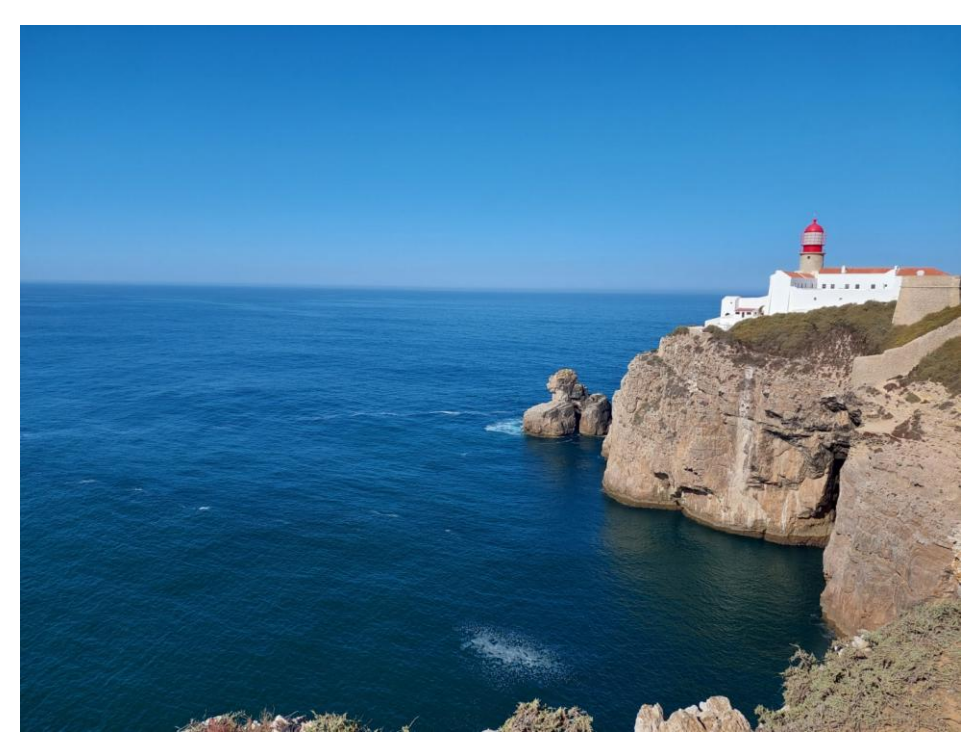
Cabo de Sao Vicente. The South West corner of Europe. We have passed 2 times with our boat Maja but this was first time on land.