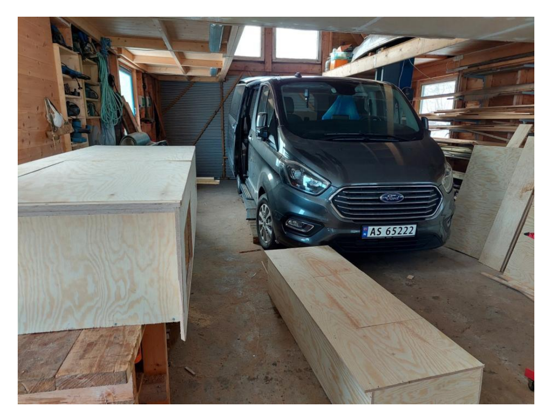
We got a new car, a Ford Hybrid. First time ever not having a VW. So, we need new camping equipment, constructed in our garage.