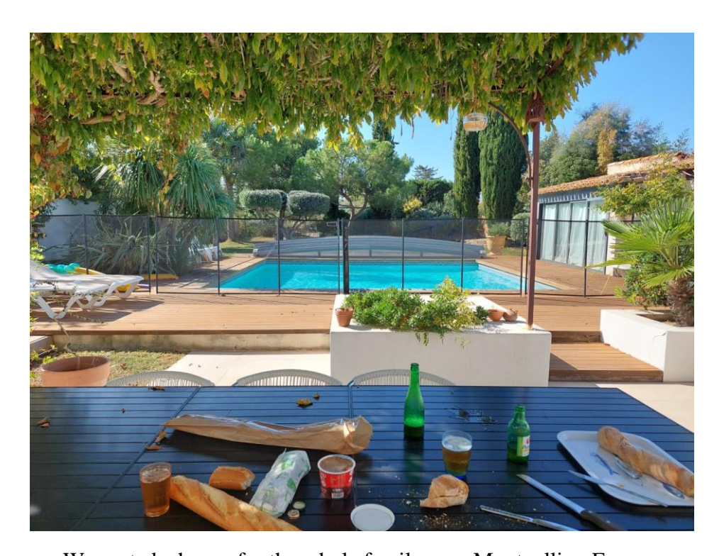
We rented a house for the whole family near Montpellier, France.