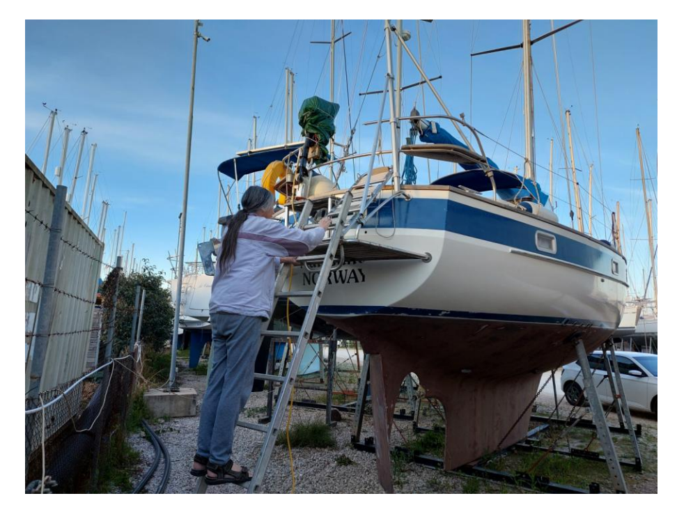
We are now almost ready for our 2-month spring trip with Hera II, just a few things to fix before putting the boat in the water. The propeller is still missing.