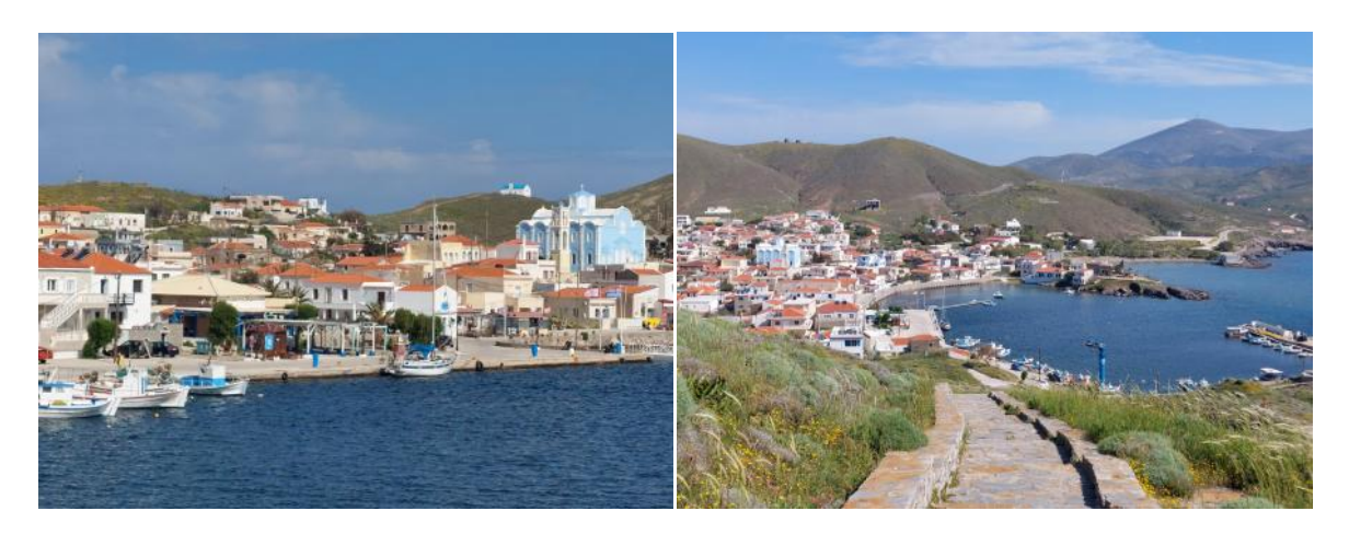
One of our two favorite islands in the Aegean, Psara.