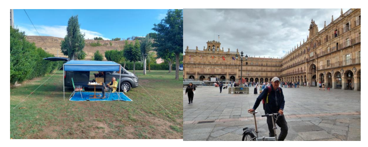
Prepared for rain.