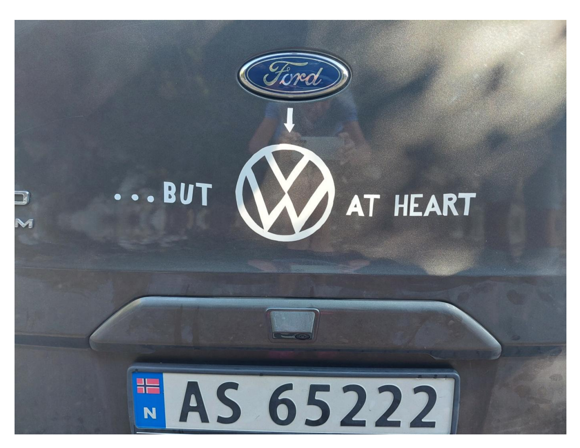
But Jeannette still thinks of the new car as a VW.