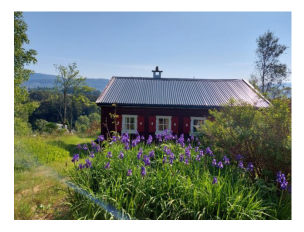
Home again and summer is there, our guest cabin in the garden.