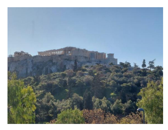
Also a stop in Athens to do more work, view from near the seismological institute.