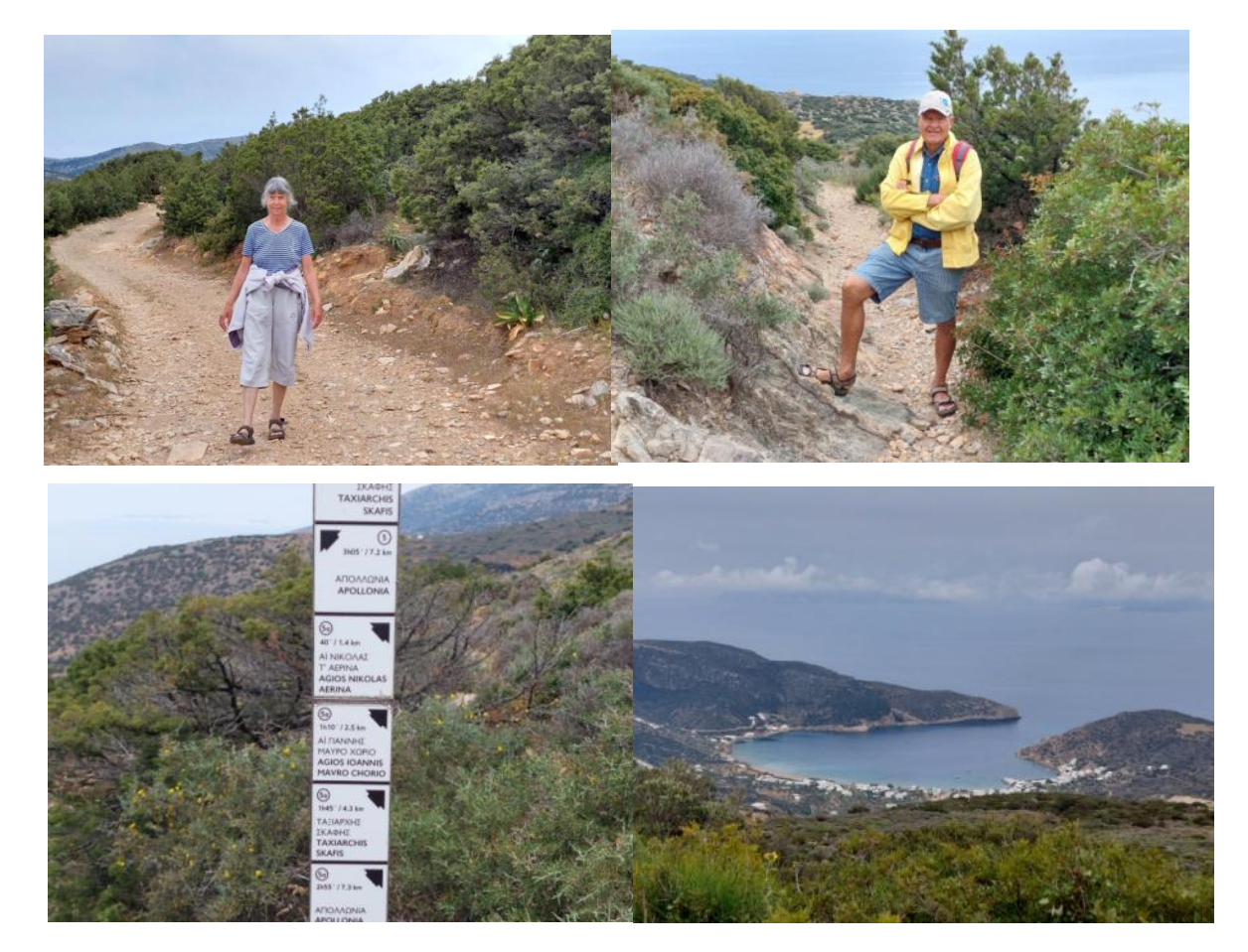
Hiking is well organized on the Aegean Islands. Sifnos.