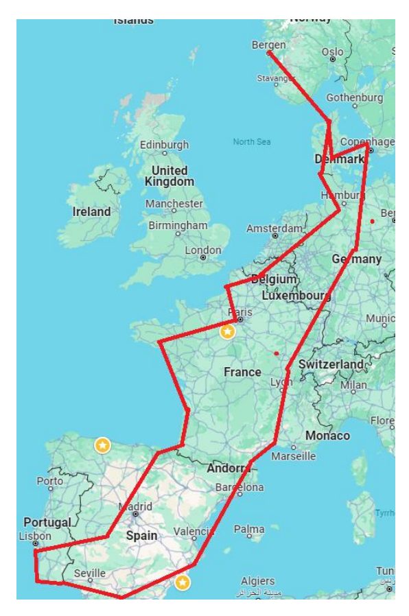
In September and October,we did a long car trip to visit people and places we had visited before. Pure nostalgia.