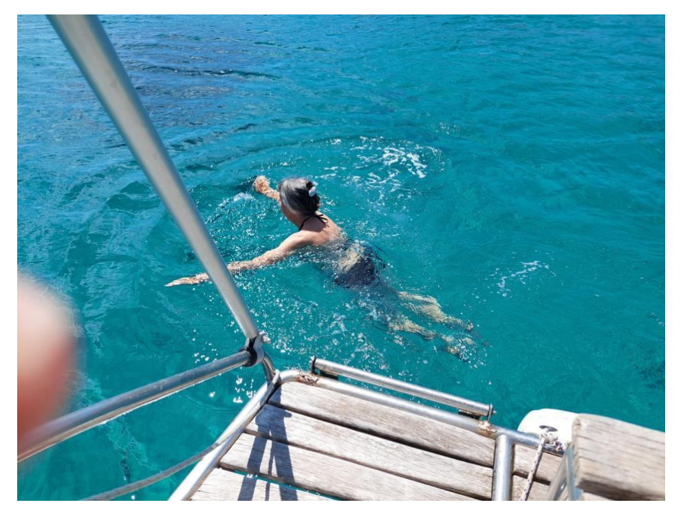
Swimming from the boat is one of the nice things about sailing in Greece.