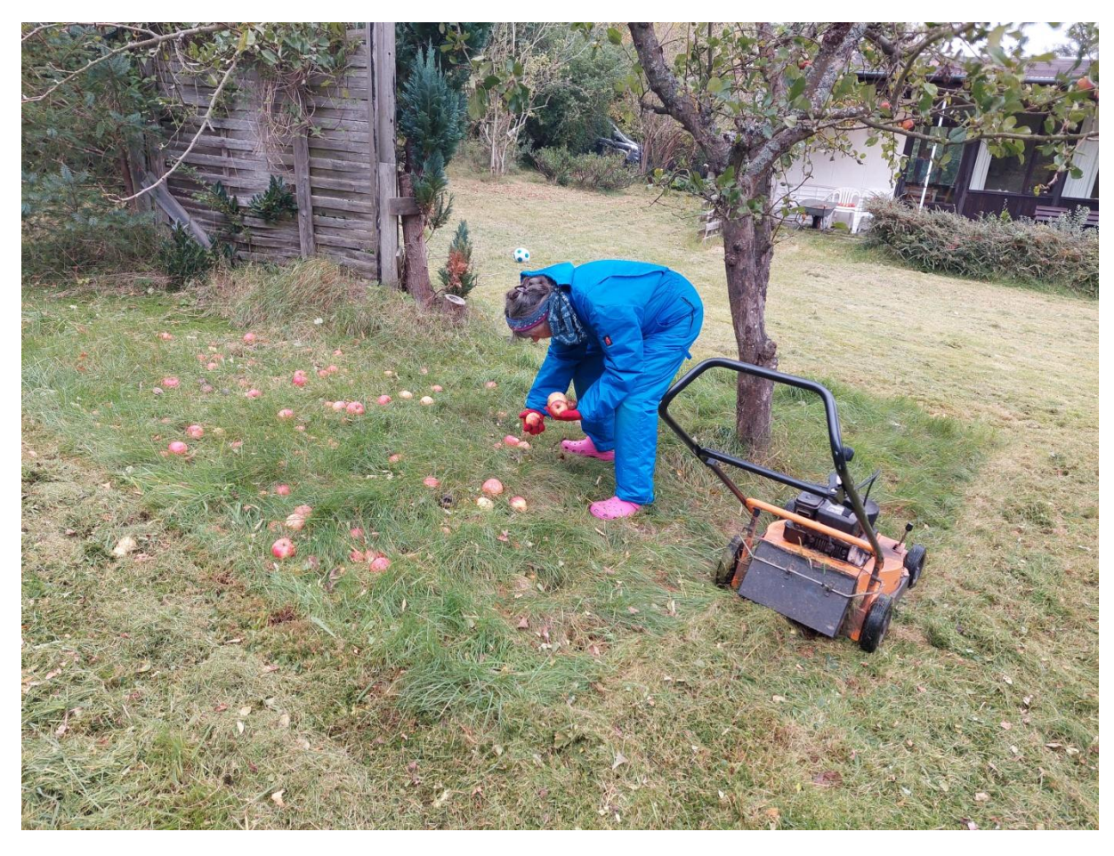
We had time to cut grass and pick apple at our sommerhouse in Denmark.