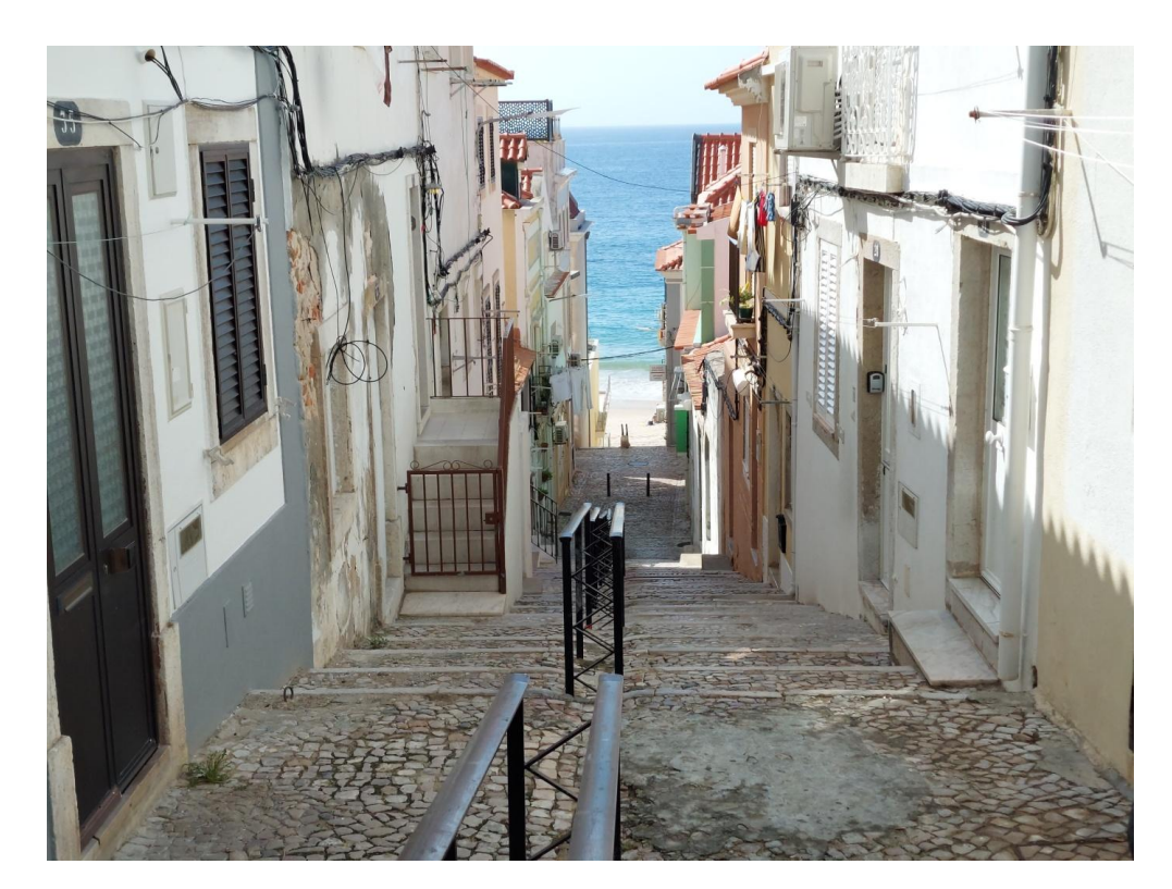
Sesimbra, our favorite harbor in Portugal.