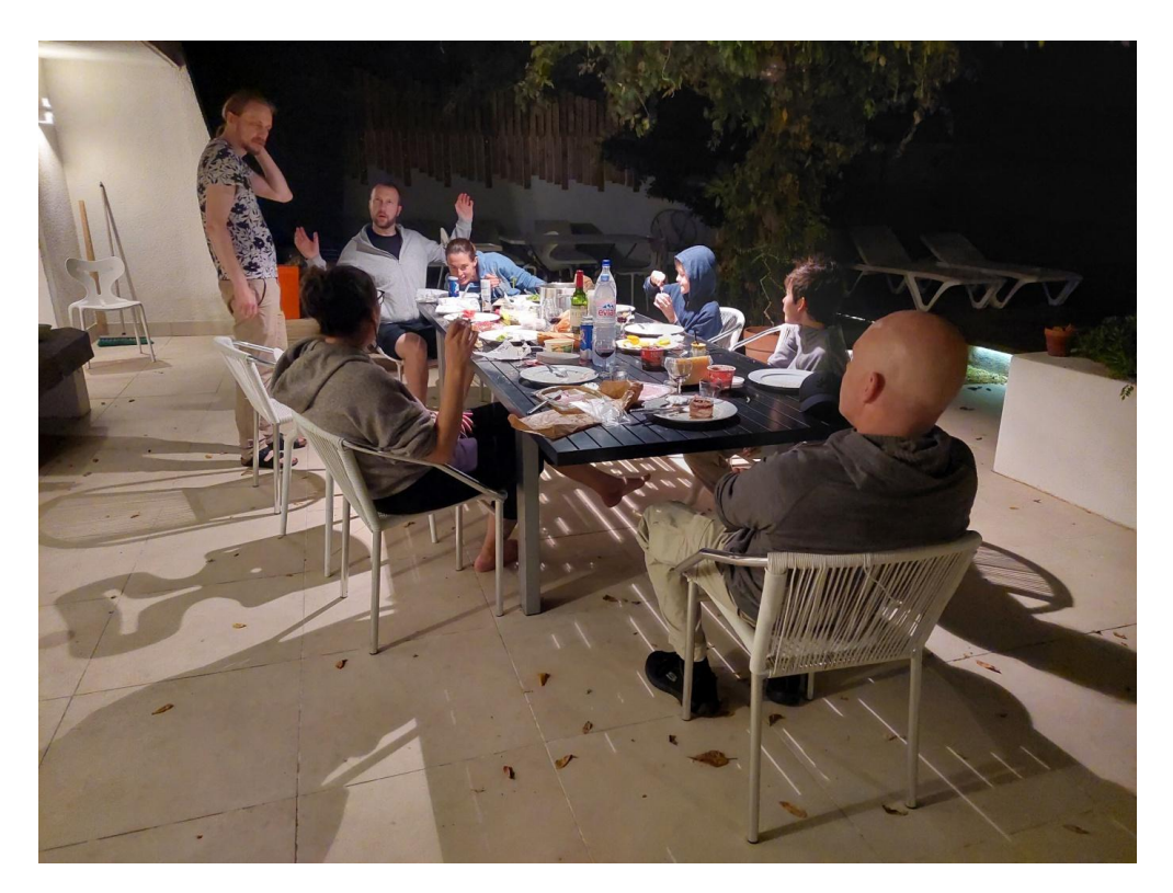
Nice dinners outside.