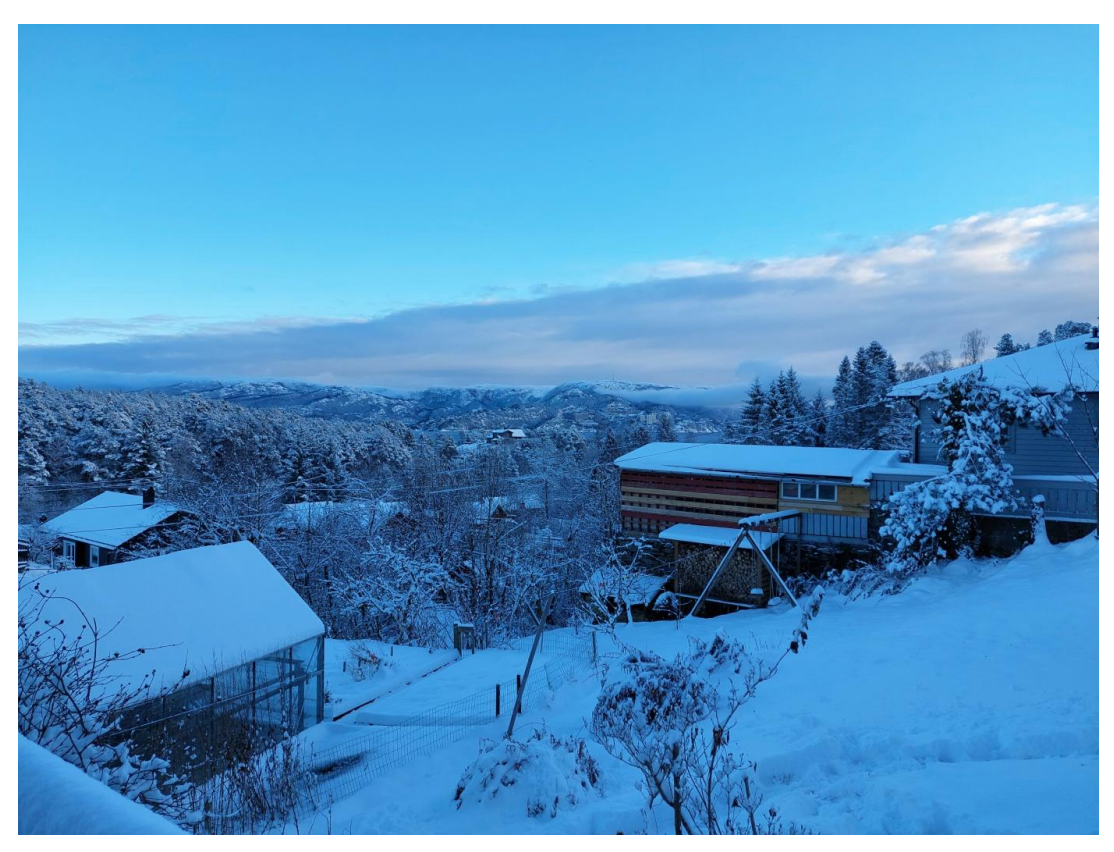
But the view is nice