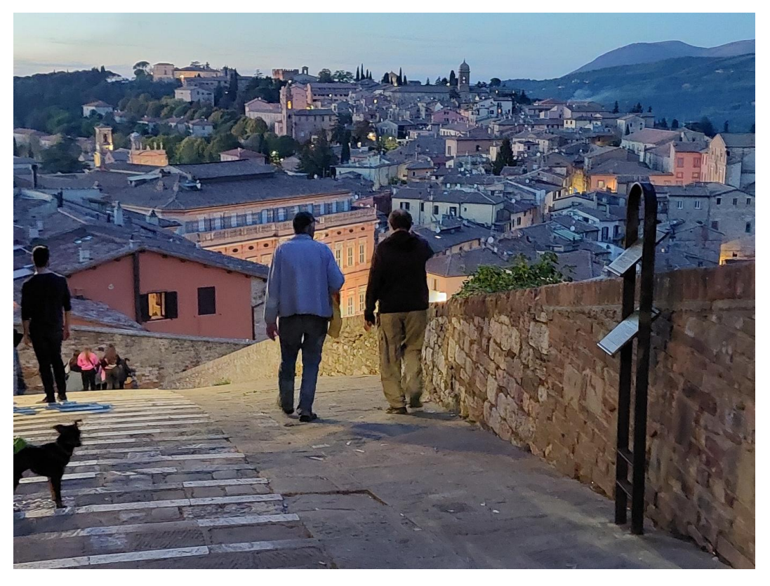
Visiting friends in Perugia, Italy