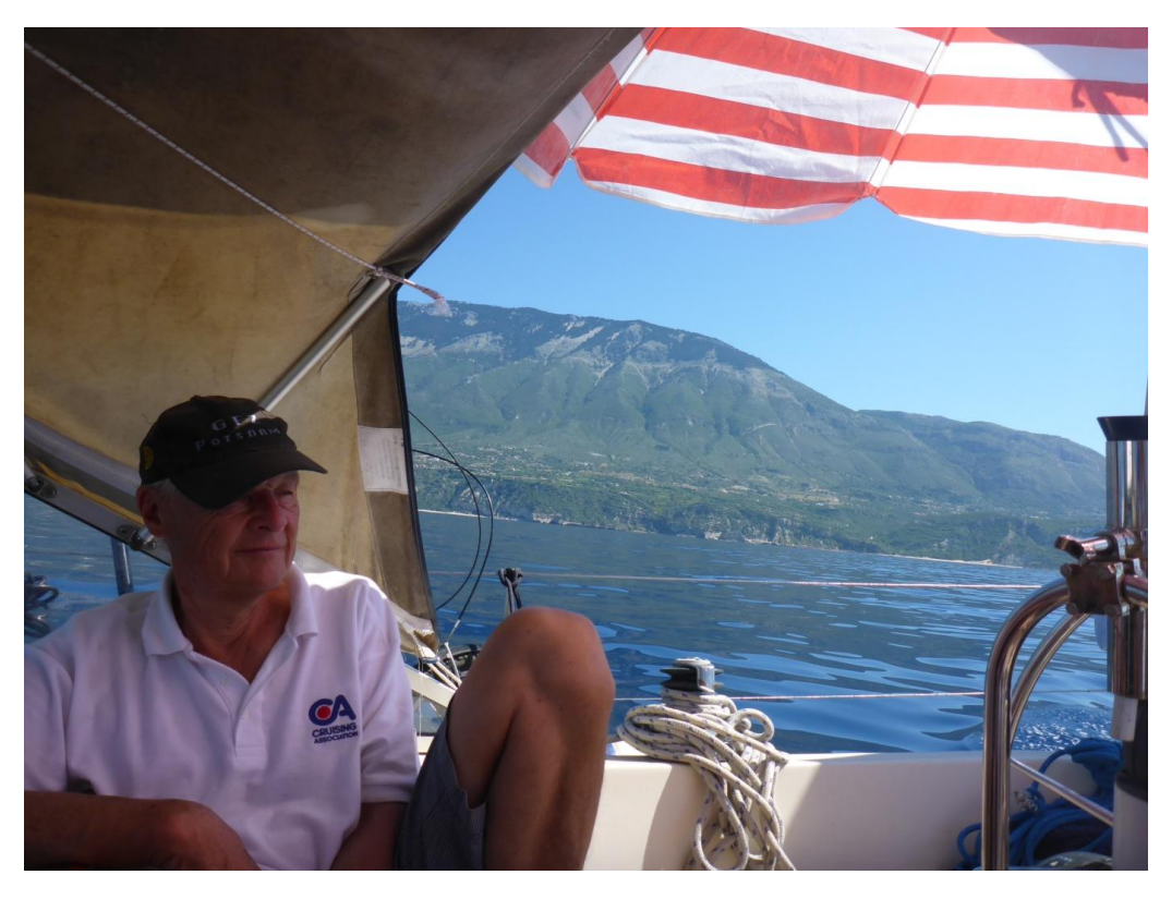
Sailing in Greece