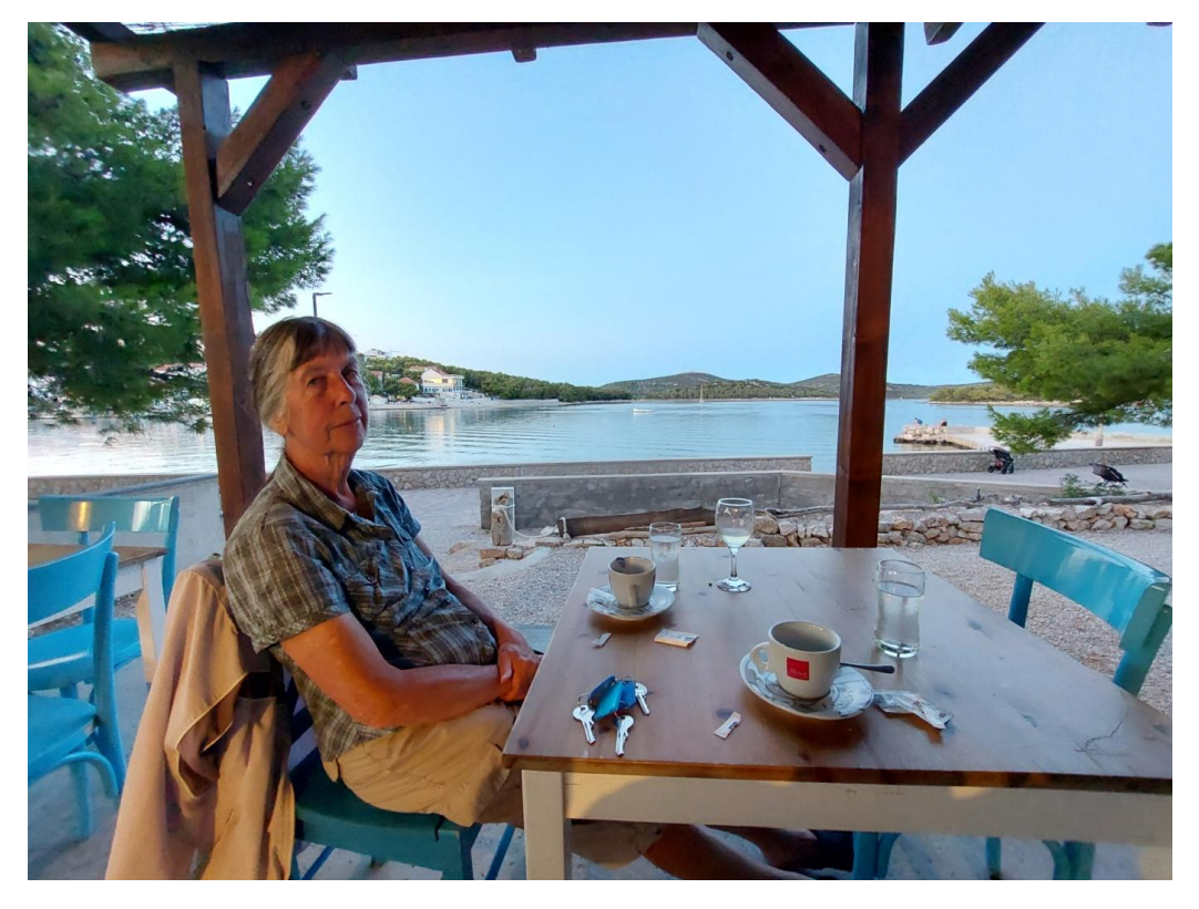
Croatia, summer is back again