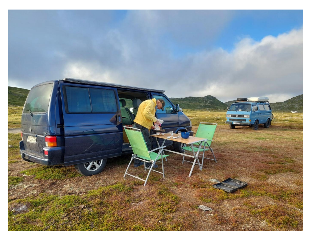
We start our 3 month camping, sailing and visits trip, here on Hardangervidda