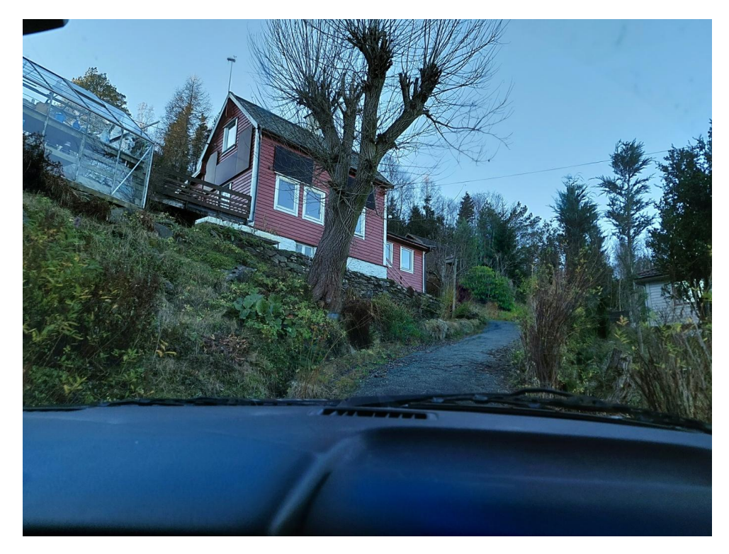
Finally home, 16-11