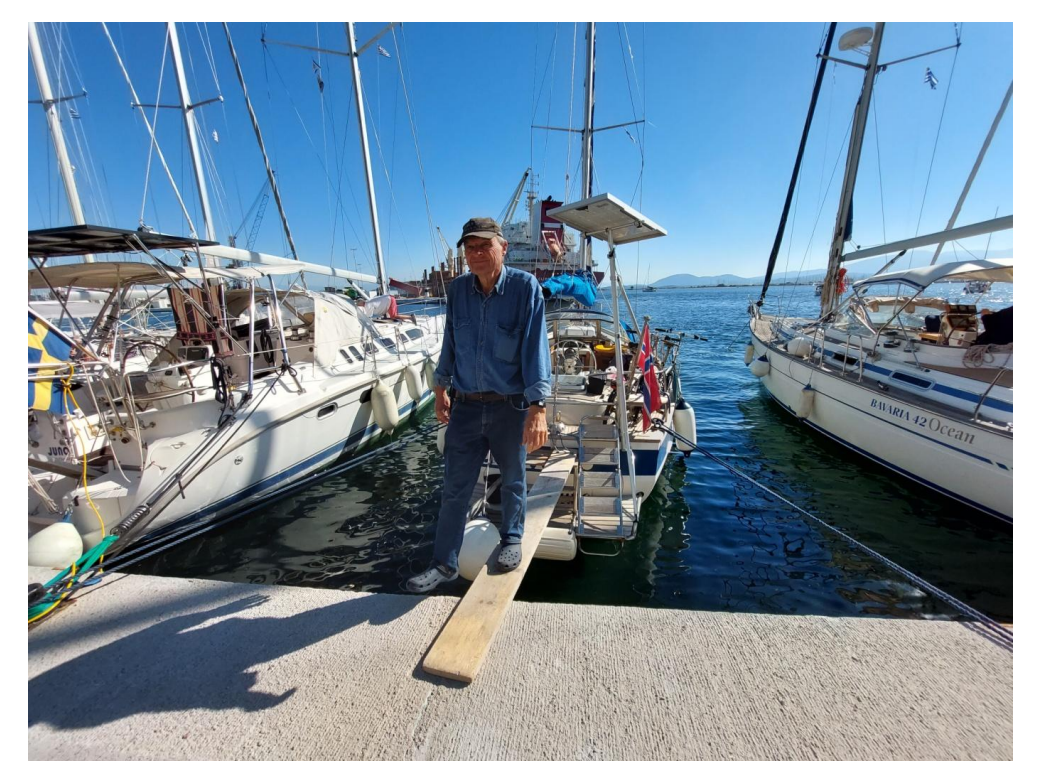
Sailing again in the Ionian