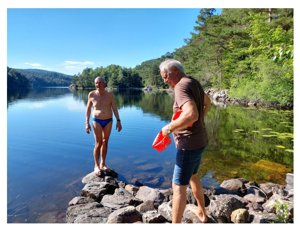
At least one day was good for swimming in our lake