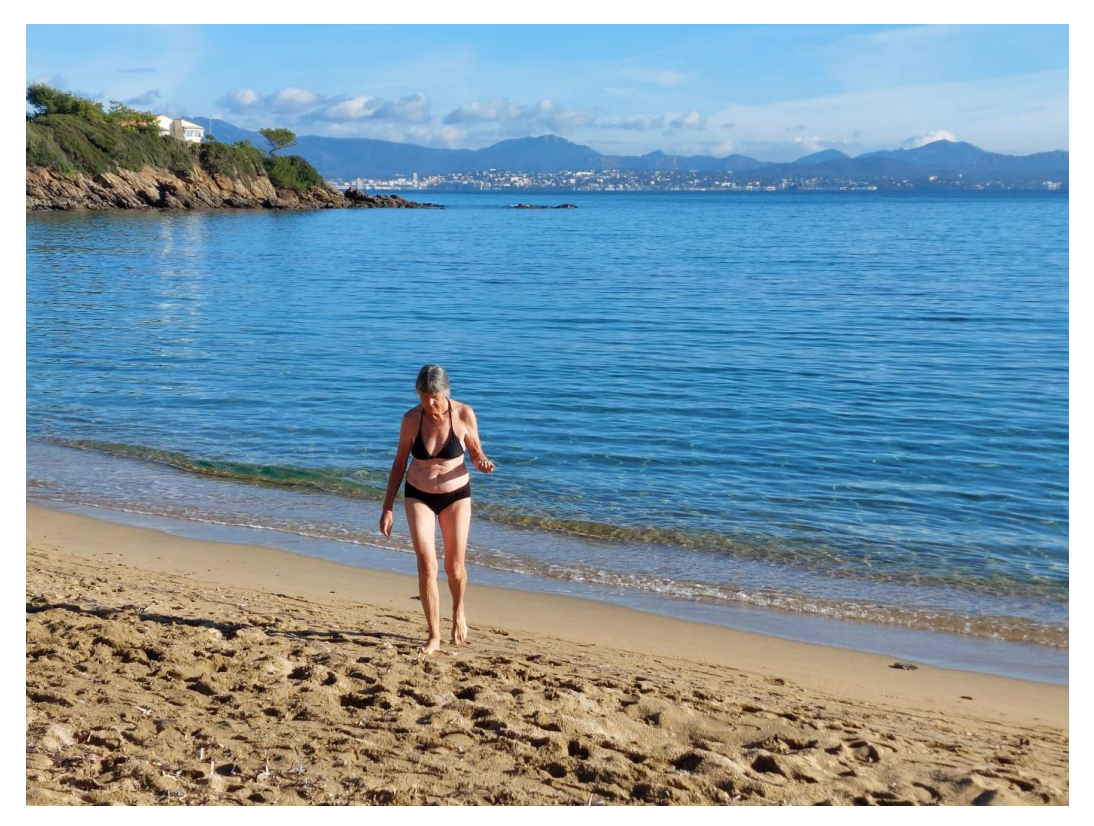
The last swim of the year at the French Riviera