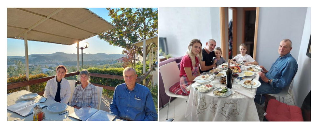
Albania with friends, one week to work