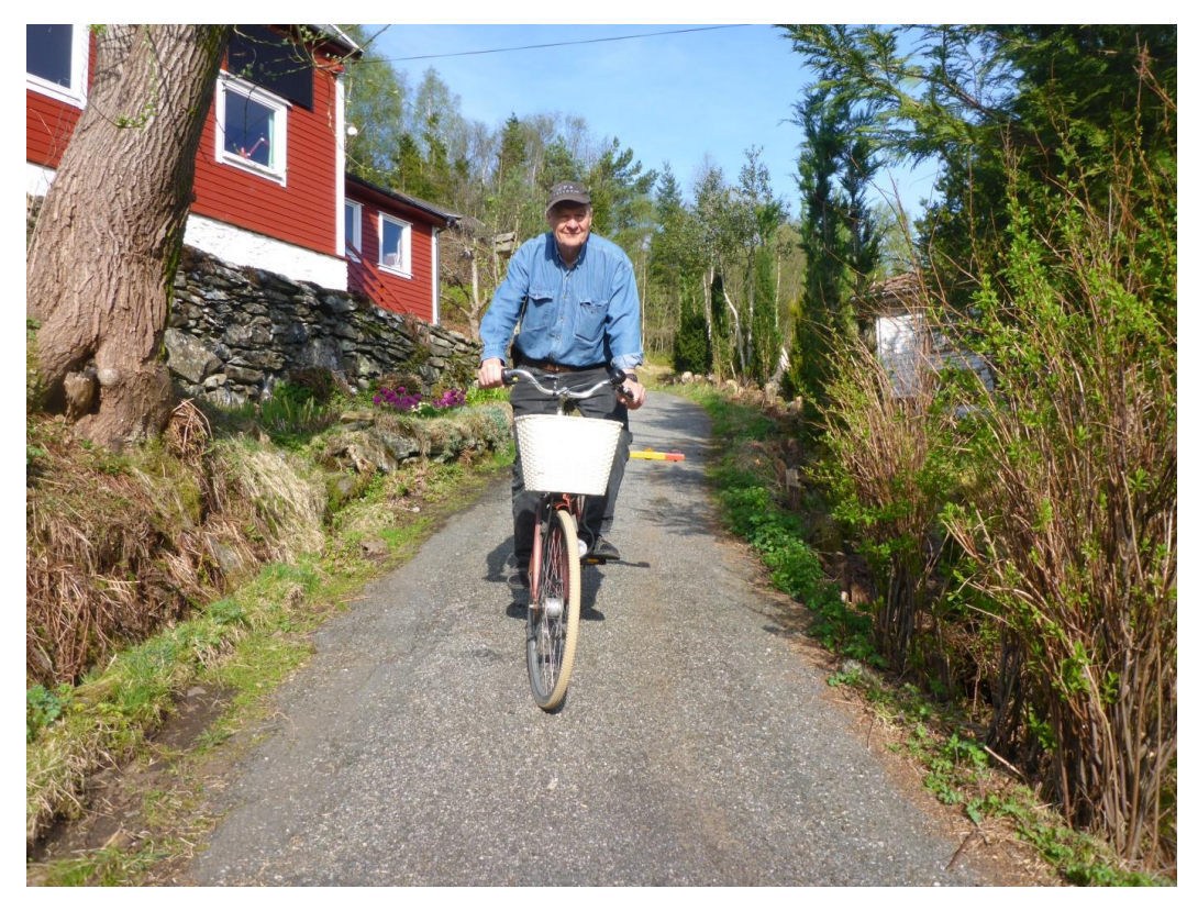
The old man is still cycling