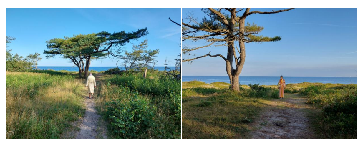
Going for a morning swim at our summer house, summer is back