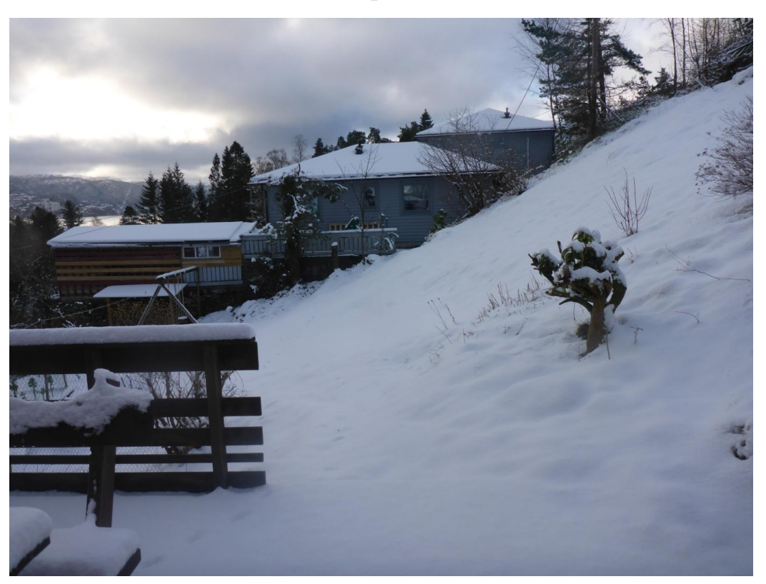
We finally got snow