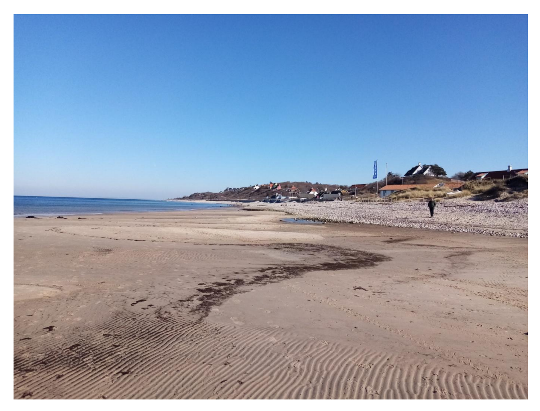
The beach in Denmark