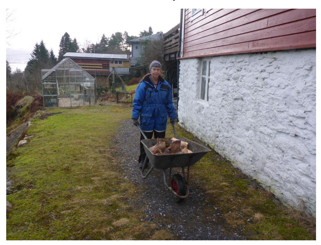
We start the year by preparing wood for next year