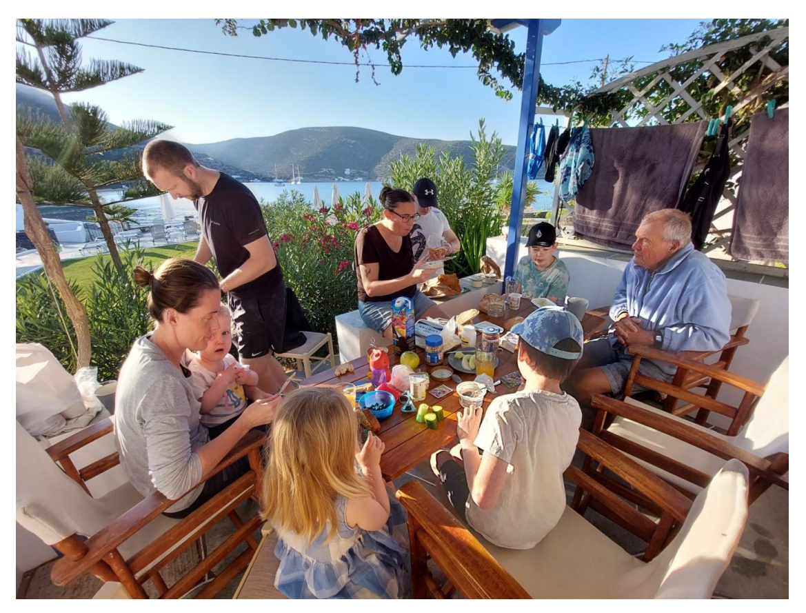
We visit the Greek island of Sifnos with the family