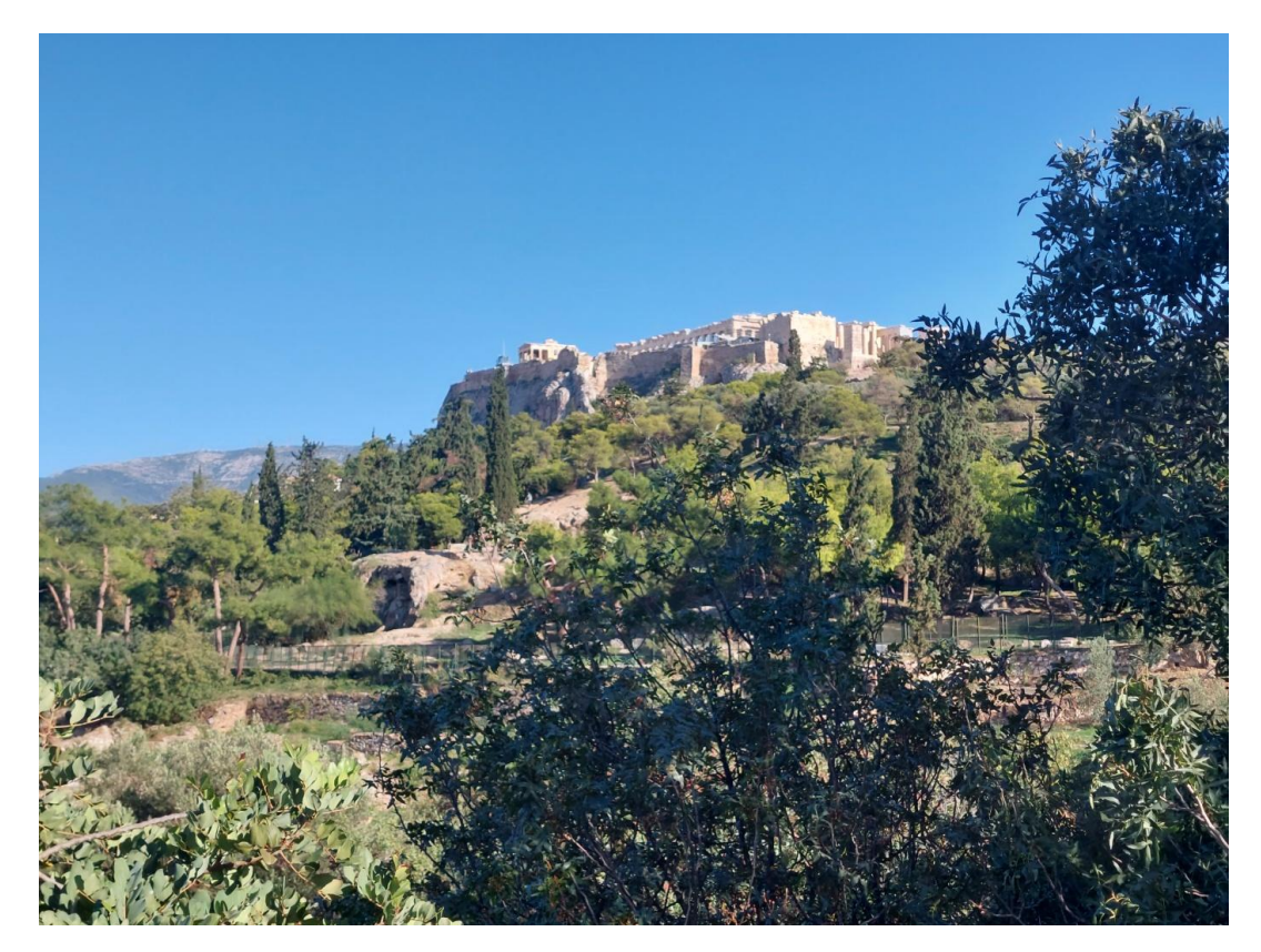
Finally Athens, a stop for one week to work