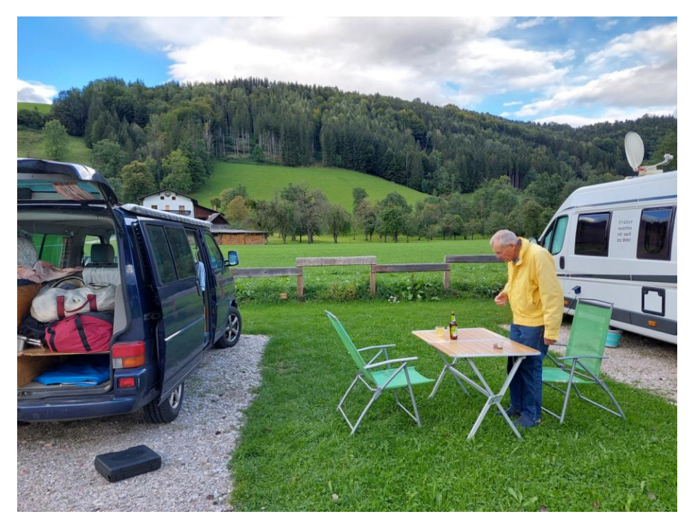
Camping in Austria, not so warm