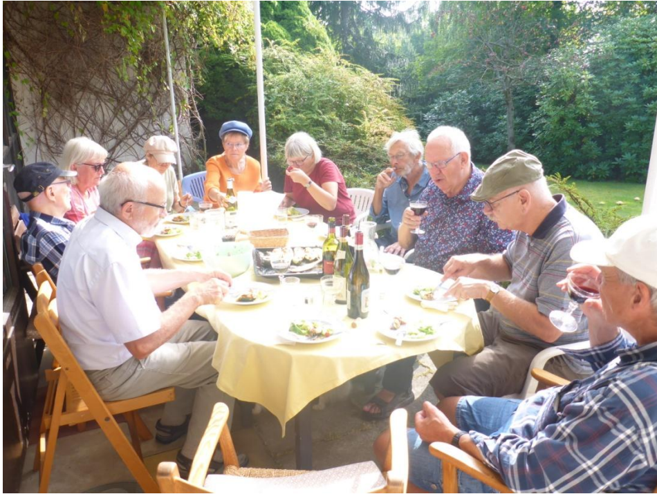
With friends in our summer house in Denmark