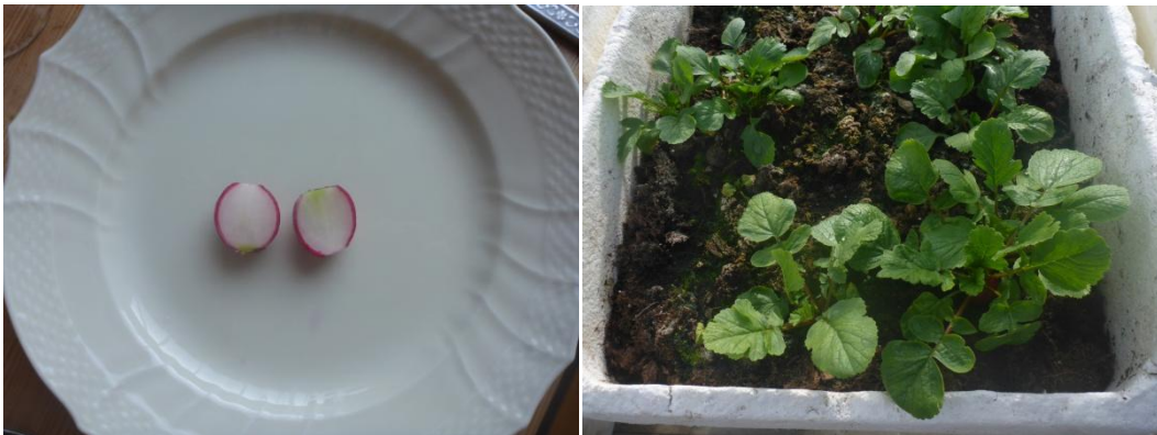
Our first harvest