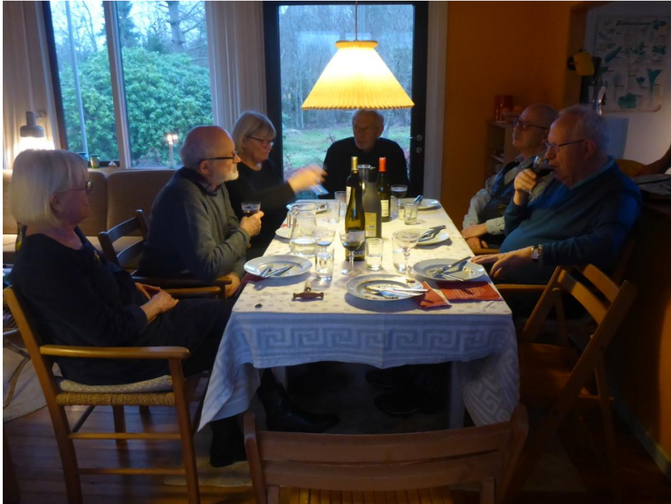
With friends in our summer house in Denmark