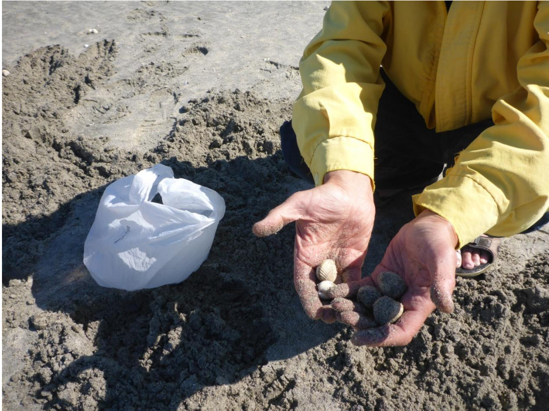
Lots of cockles