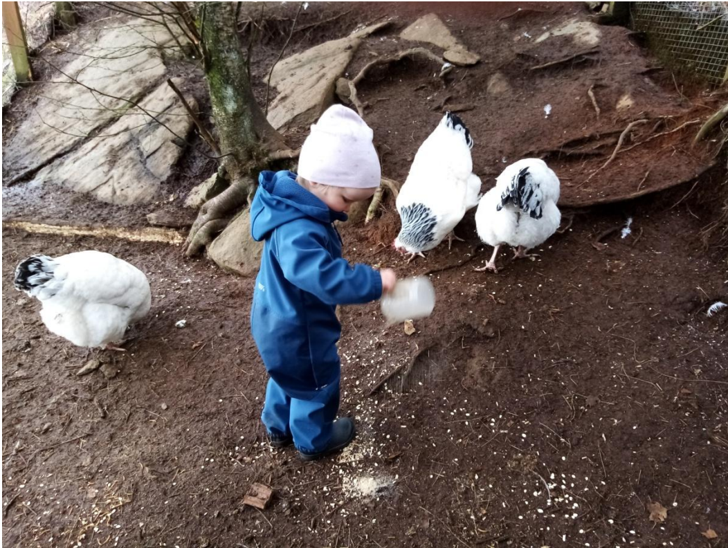
Pia feeds our chicken