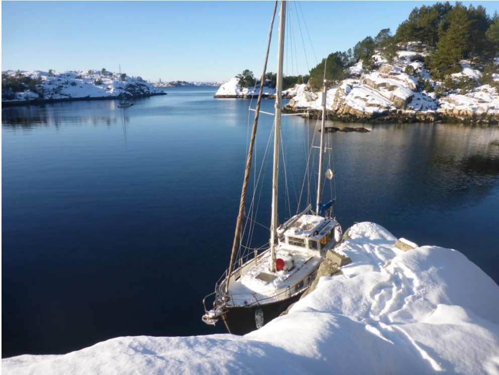
Boat trip to nearby island in the good weather