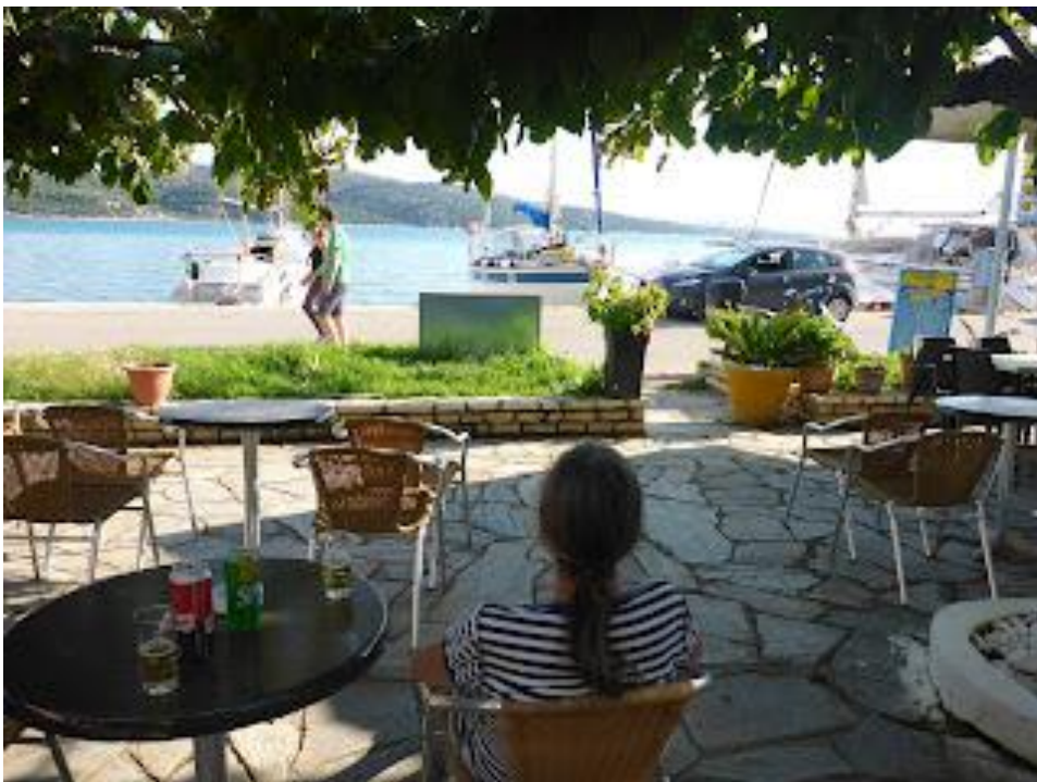
Away from the cold, trip to the boat (in background) in Greece