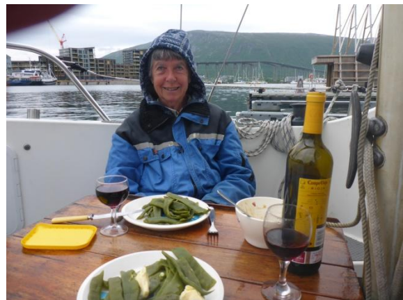
Tromsø, the weather was not so good