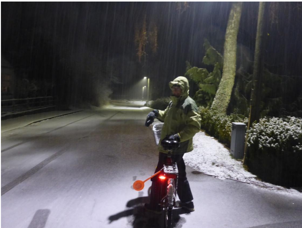
And there was snow there too