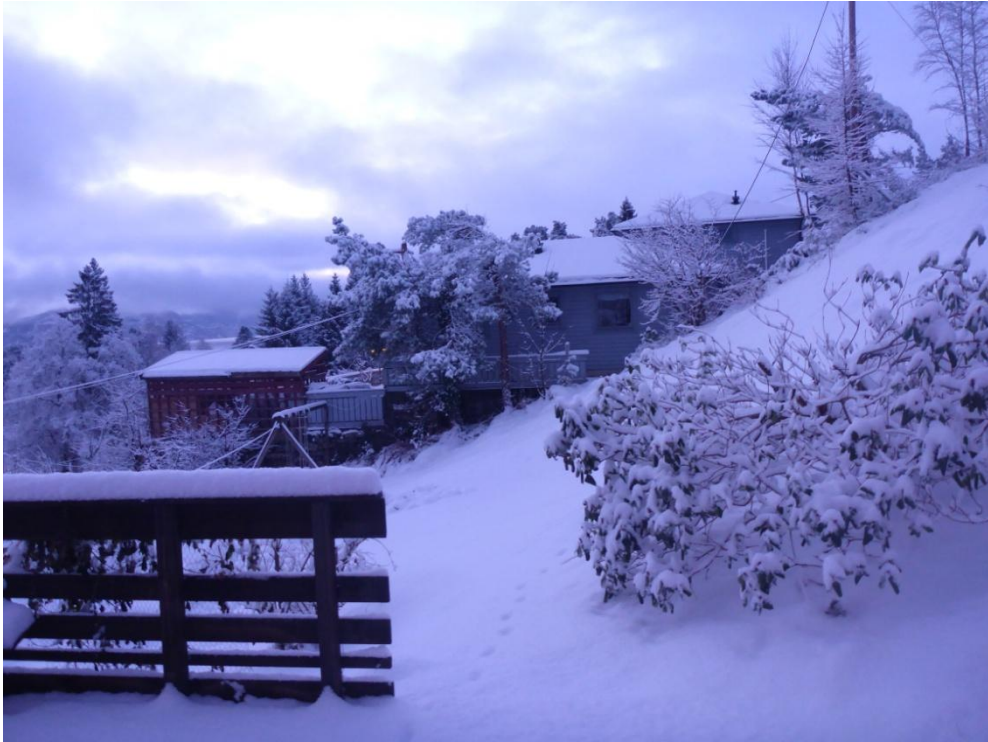
It started with snow