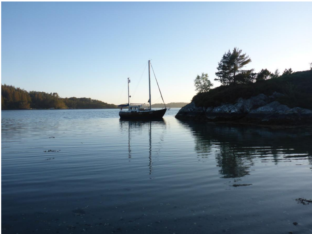
First stop, the weather was still good