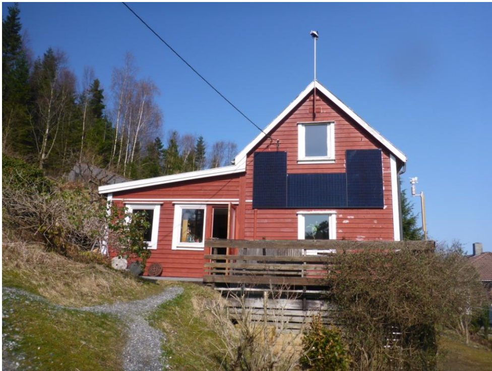
10 kW of solar panels installed