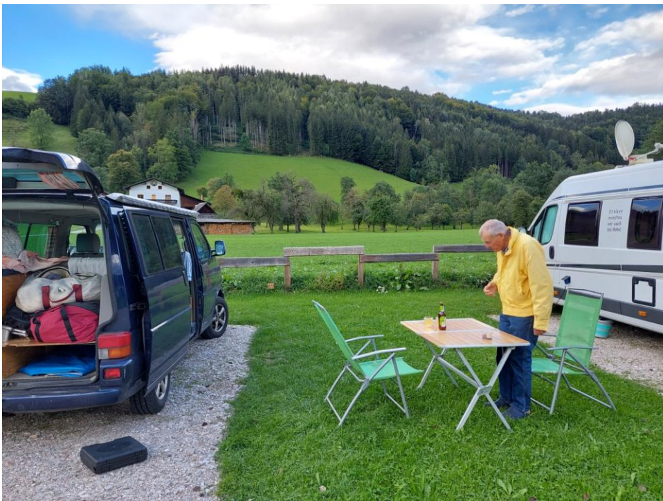
Camping in Austria, not so warm