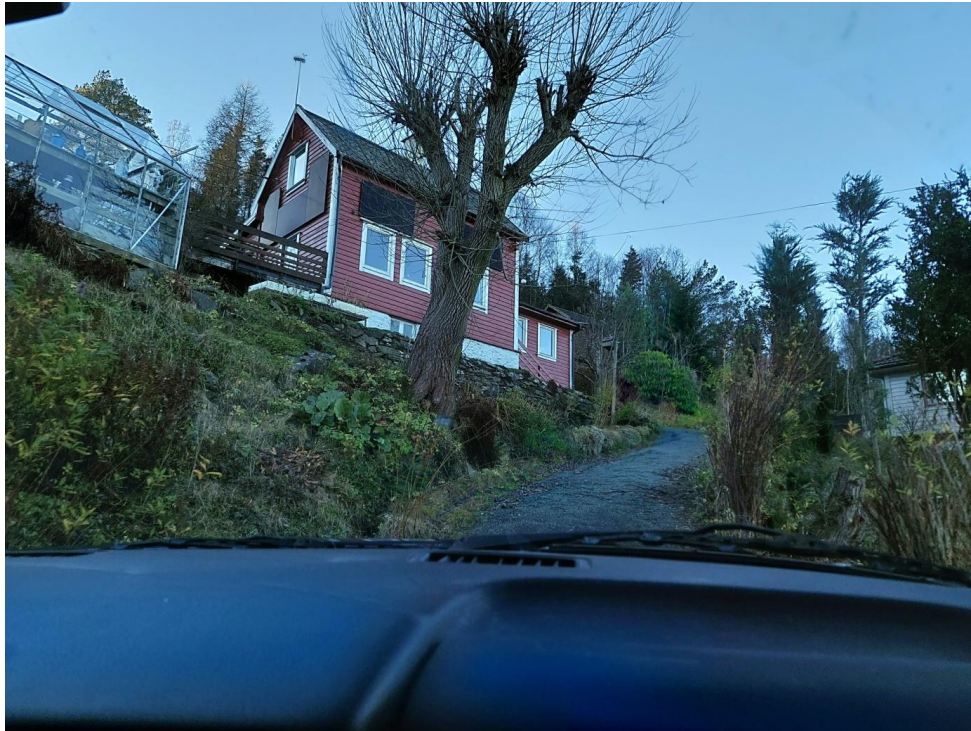
Finally home, 16-11