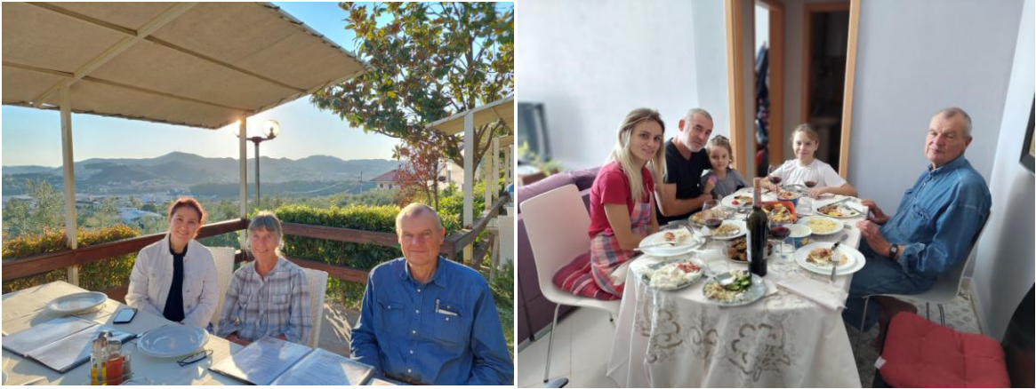
Albania with friends, one week to work