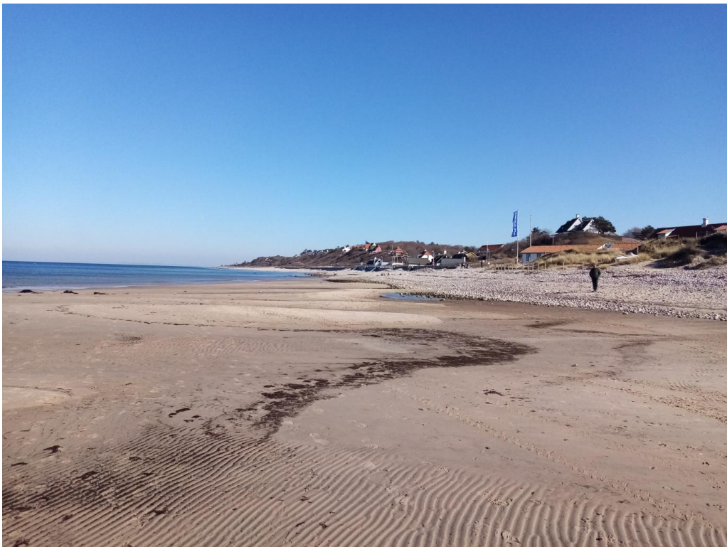
The beach in Denmark