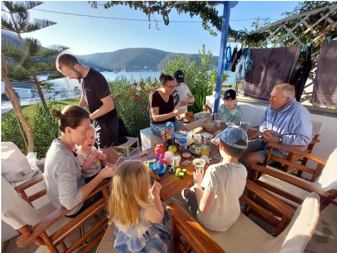
We visit the Greek island of Sifnos with the family