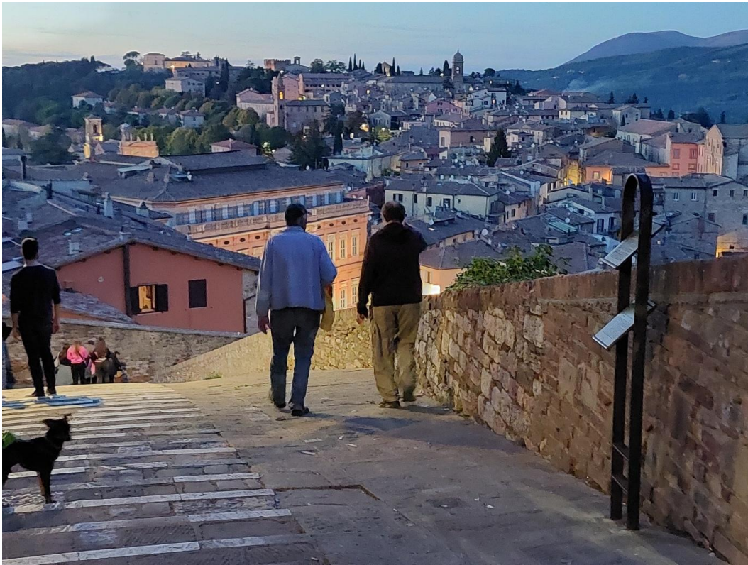
Visiting friends in Perugia, Italy