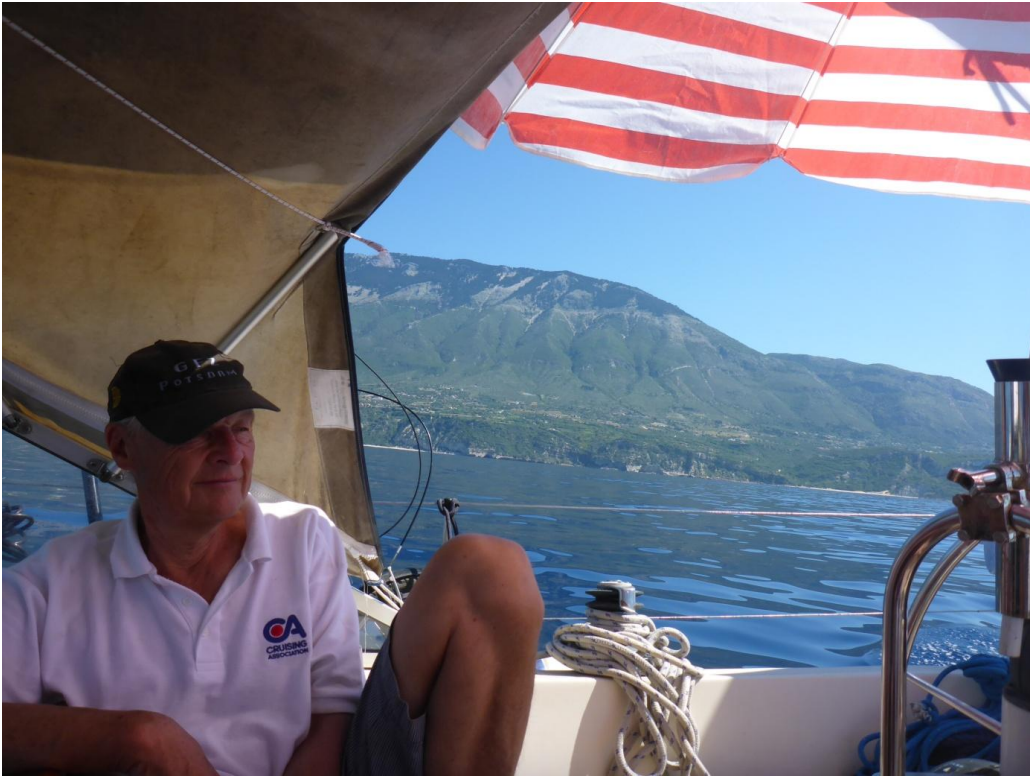
Sailing in Greece