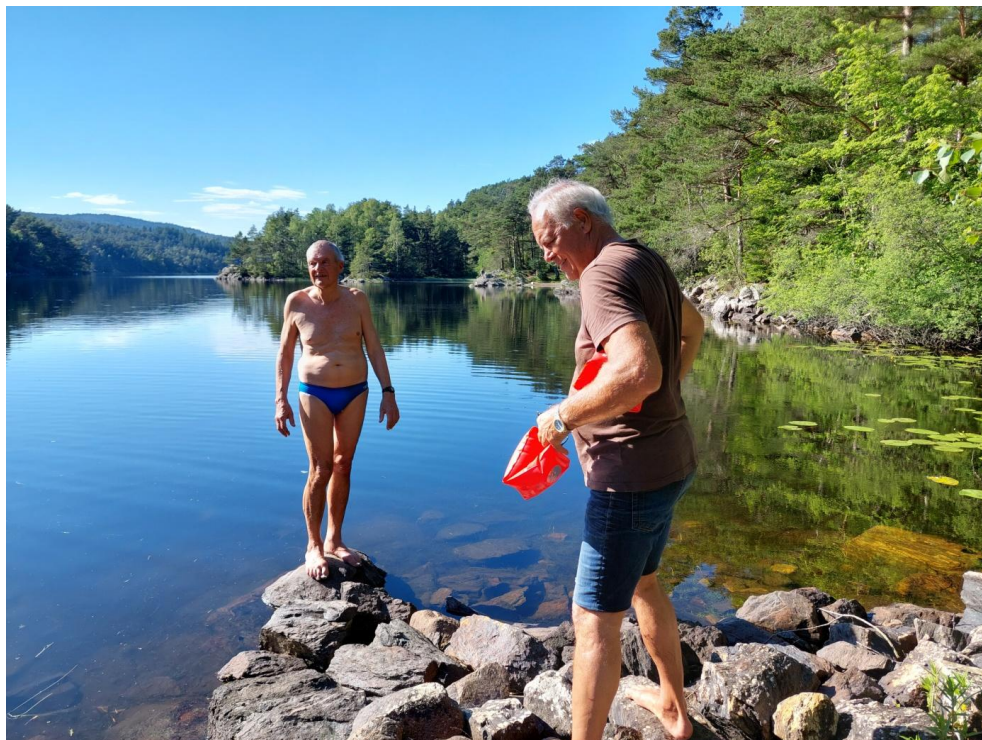
At least one day was good for swimming in our lake