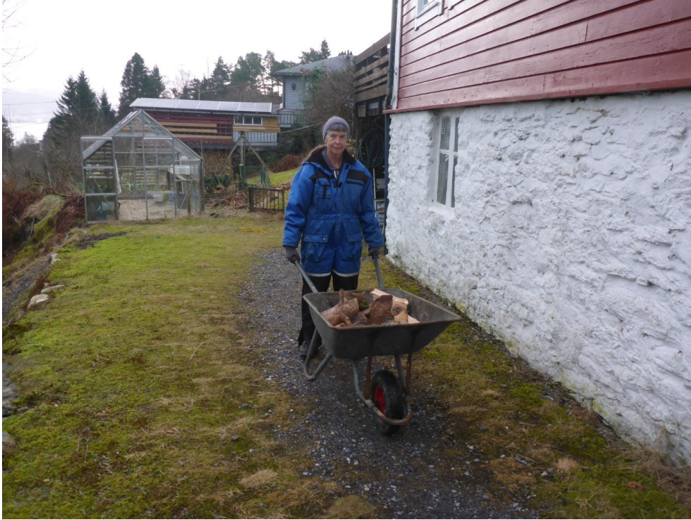
We start the year by preparing wood for next year