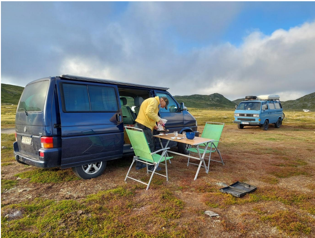
We start our 3 month camping, sailing and visits trip, here on Hardangervidda