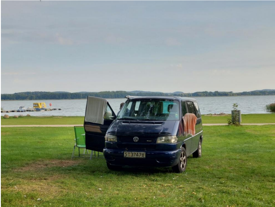
Camping in Germany