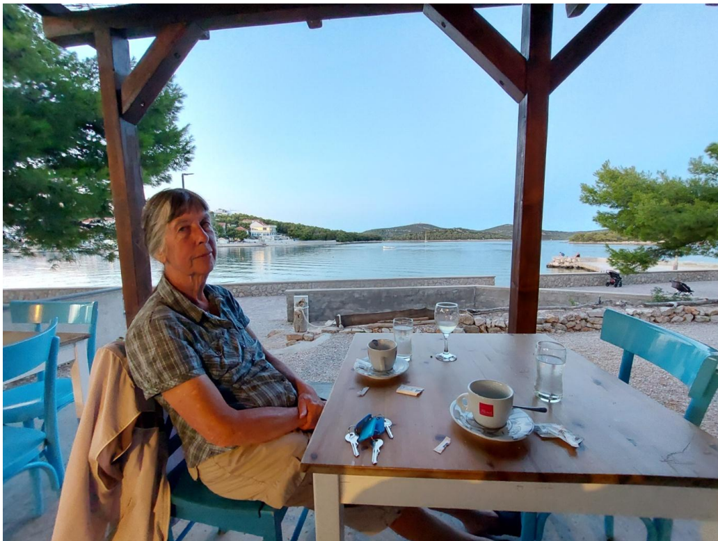
Croatia, summer is back again