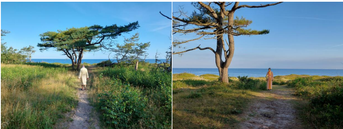
Going for a morning swim at our summer house, summer is back