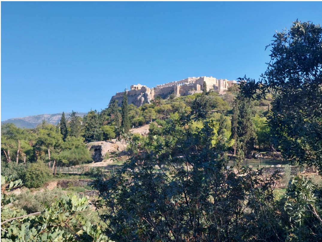
Finally Athens, a stop for one week to work