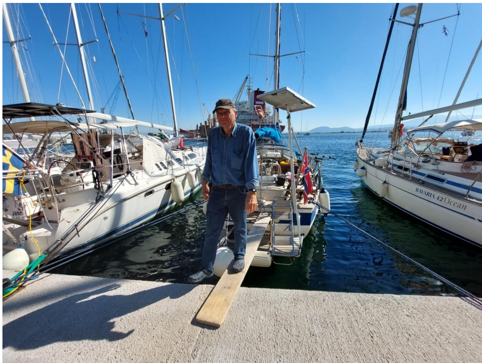
Sailing again in the Ionian