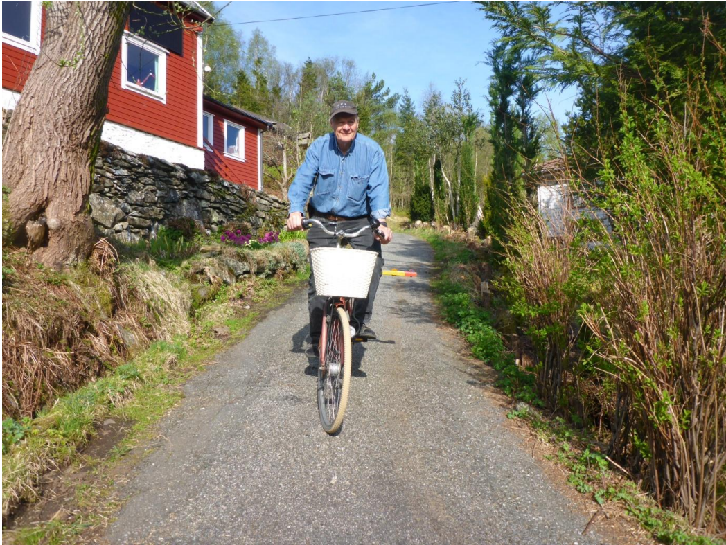
The old man is still cycling